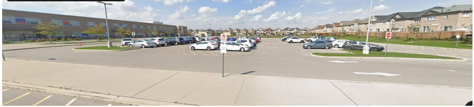
Kiss and Ride