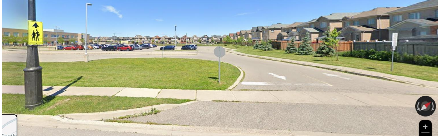
Entrance/Exit to School