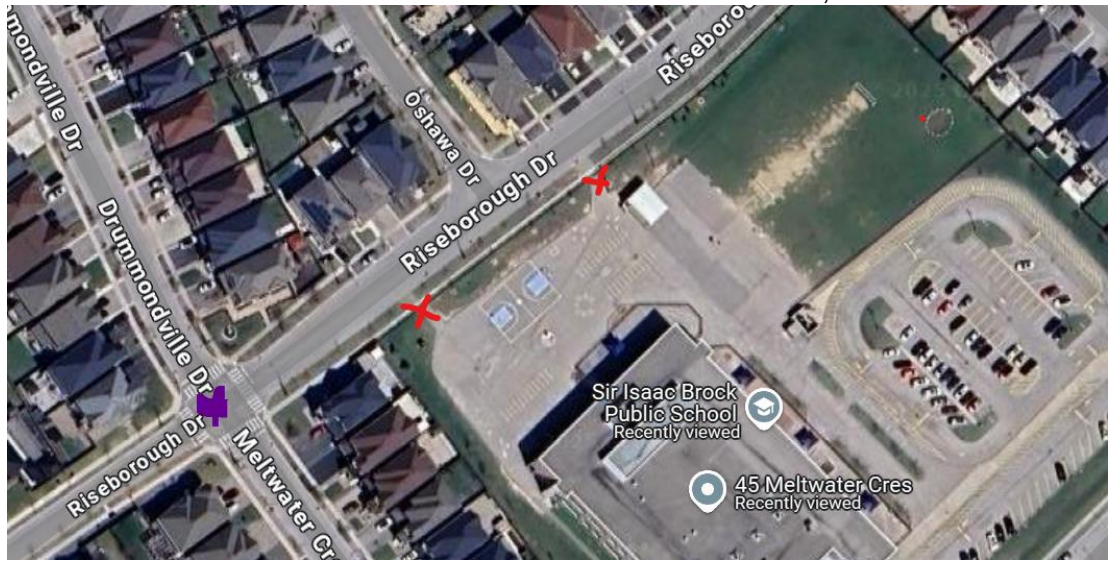
Location – Crossing Guard-Drummondville and Riseborough