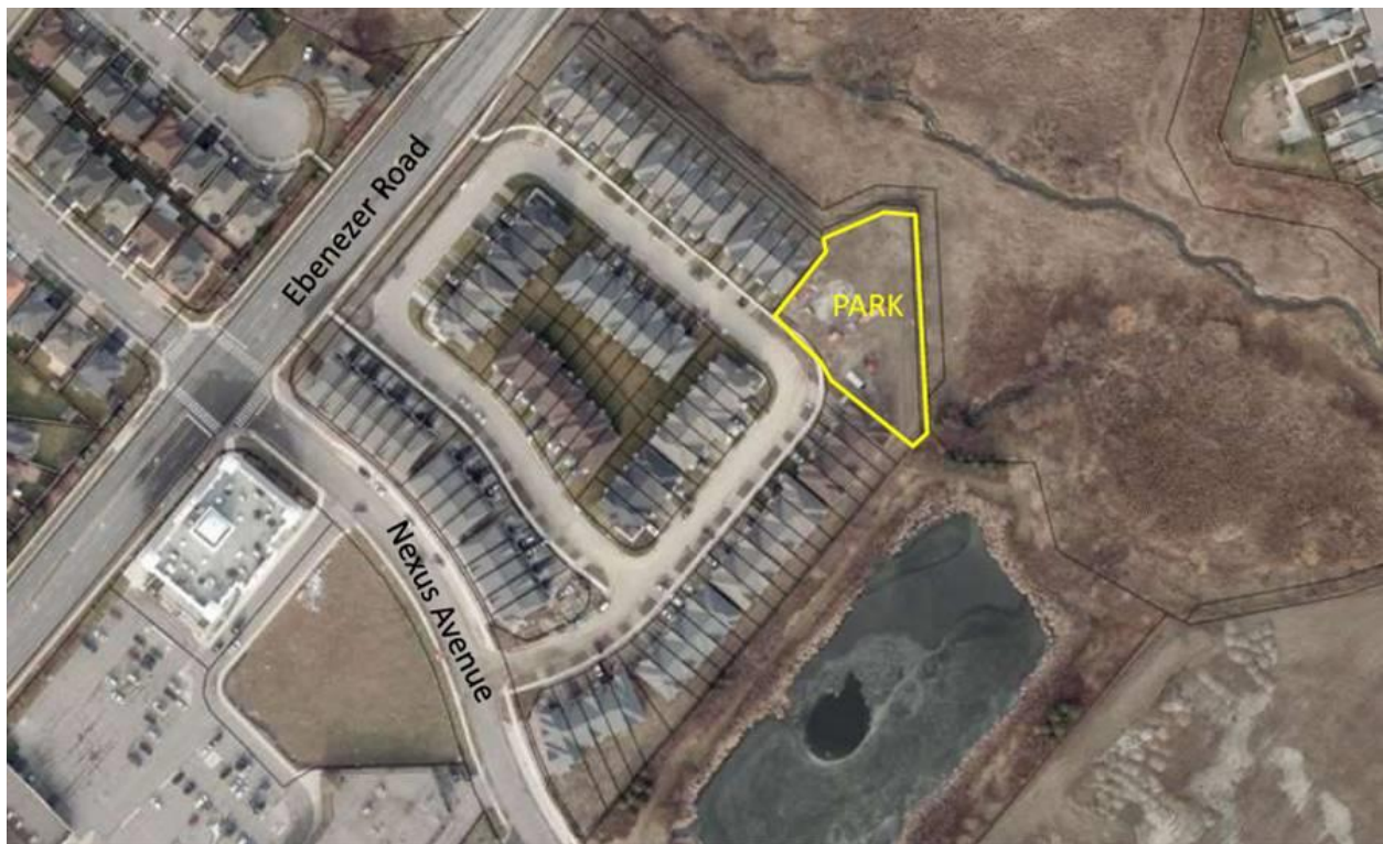
Davenfield Parkette, Davenfield Circle (Ward 8), under construction