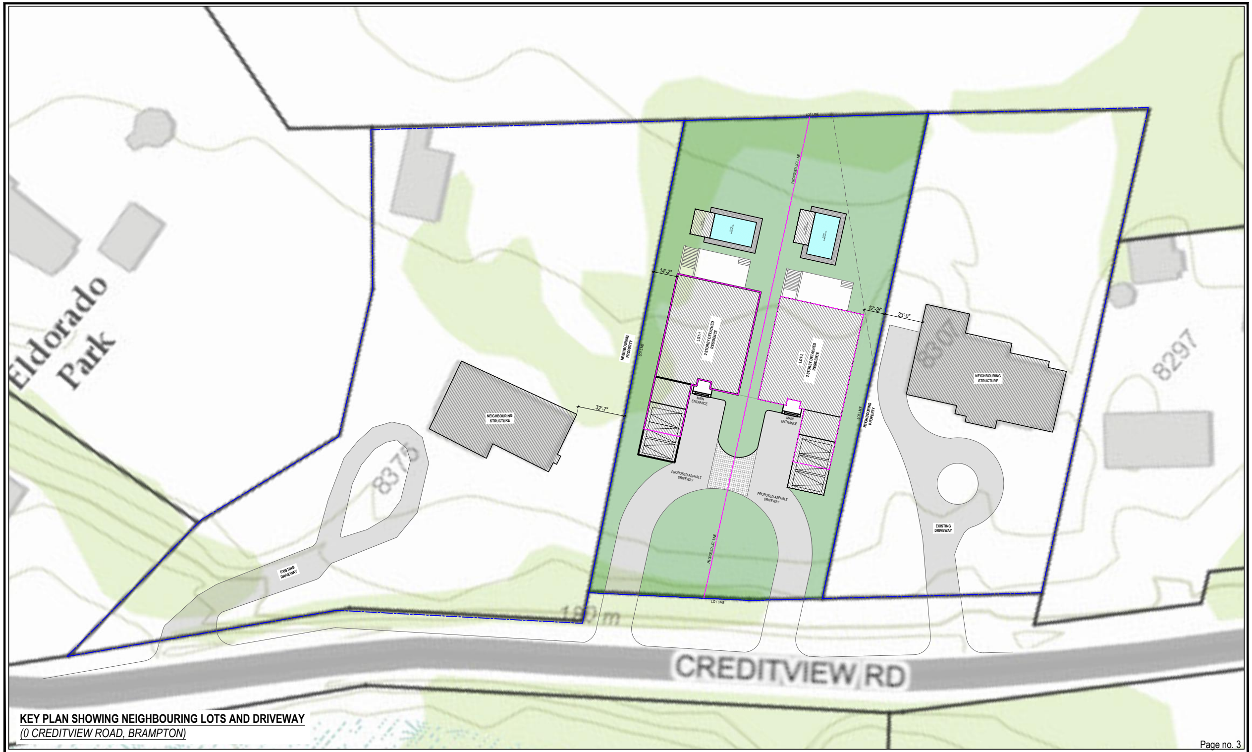
KEY PLAN SHOWING NEIGHBOURING LOTS AND DRIVEWAY (0 CREDITVIEW ROAD, BRAMPTON)