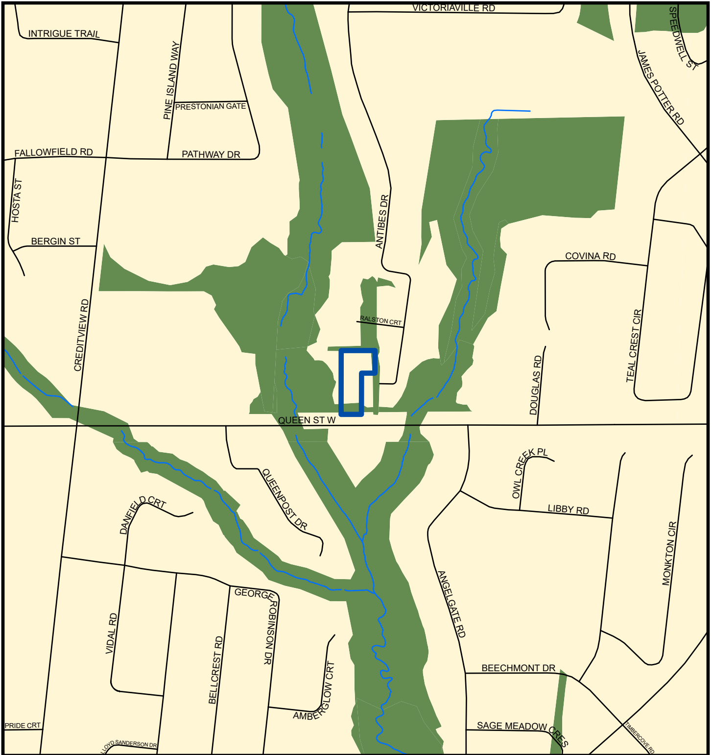
EXTRACT FROM SCHEDULE A (GENERAL LAND USE DESIGNATIONS) OF THE CITY OF BRAMPTON OFFICIAL PLAN