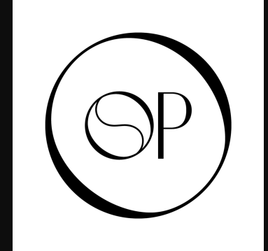
OP Wellness Services Corp.