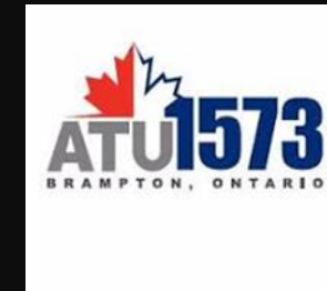
ATU Local 1573