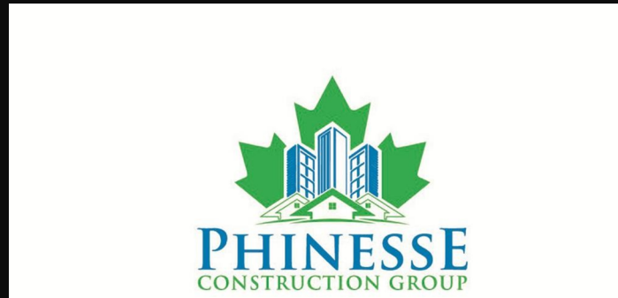
Phinnesse Construction Group