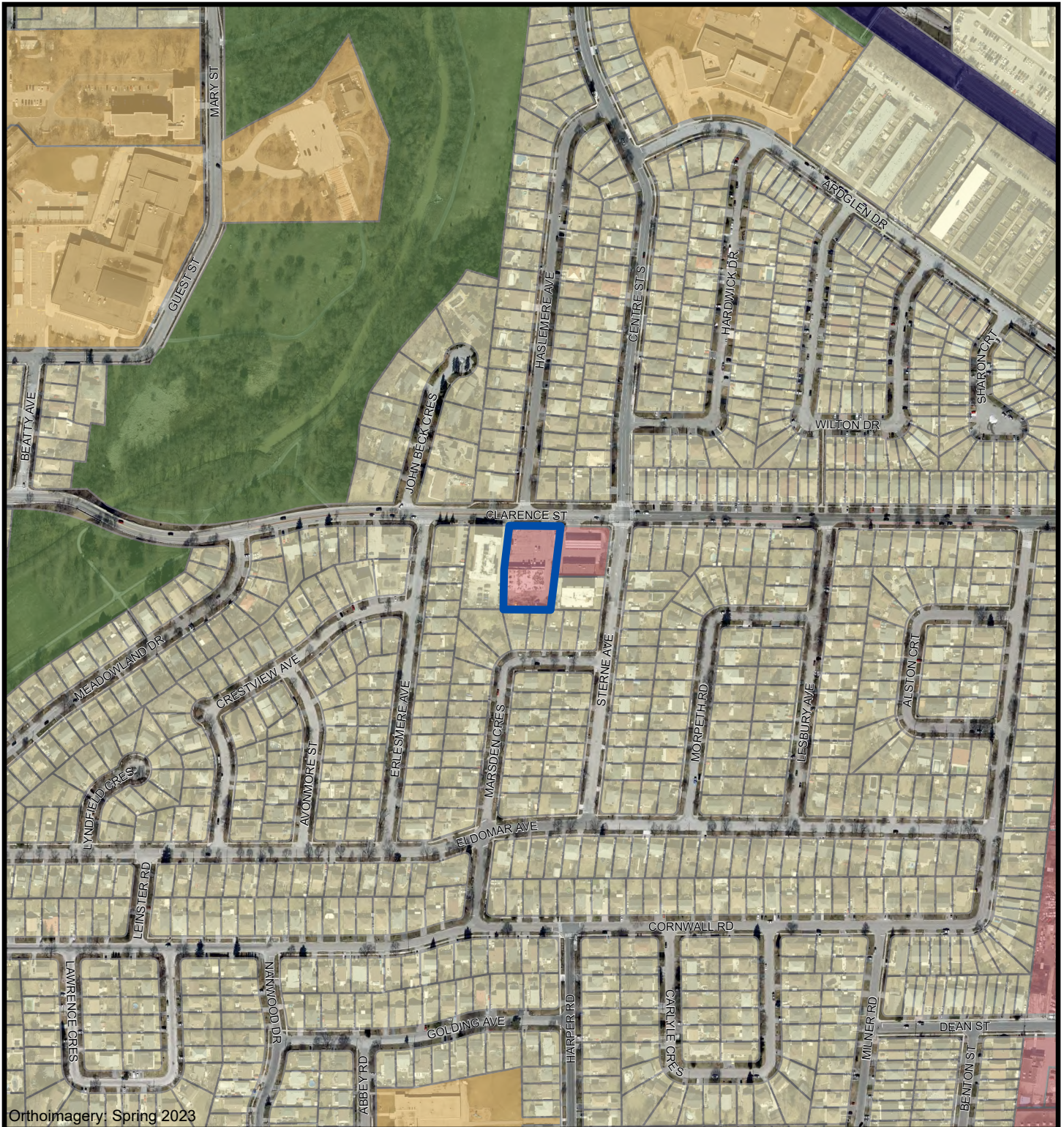
Orthoimagery: Spring 2023