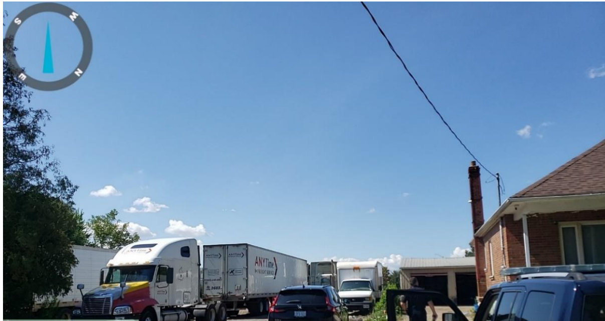
11 - Zoned RE2