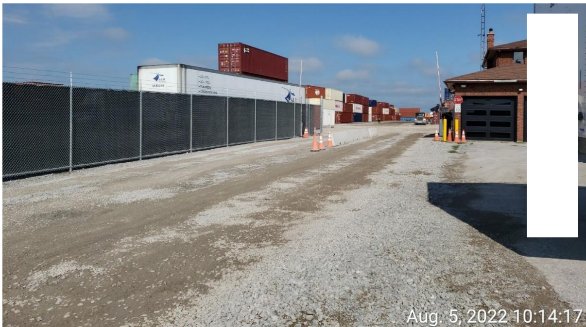
15 - Zoned Residential