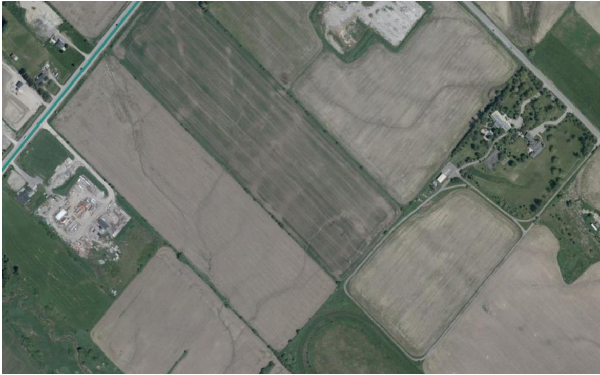
1 - Zoned Agricultural (2019)