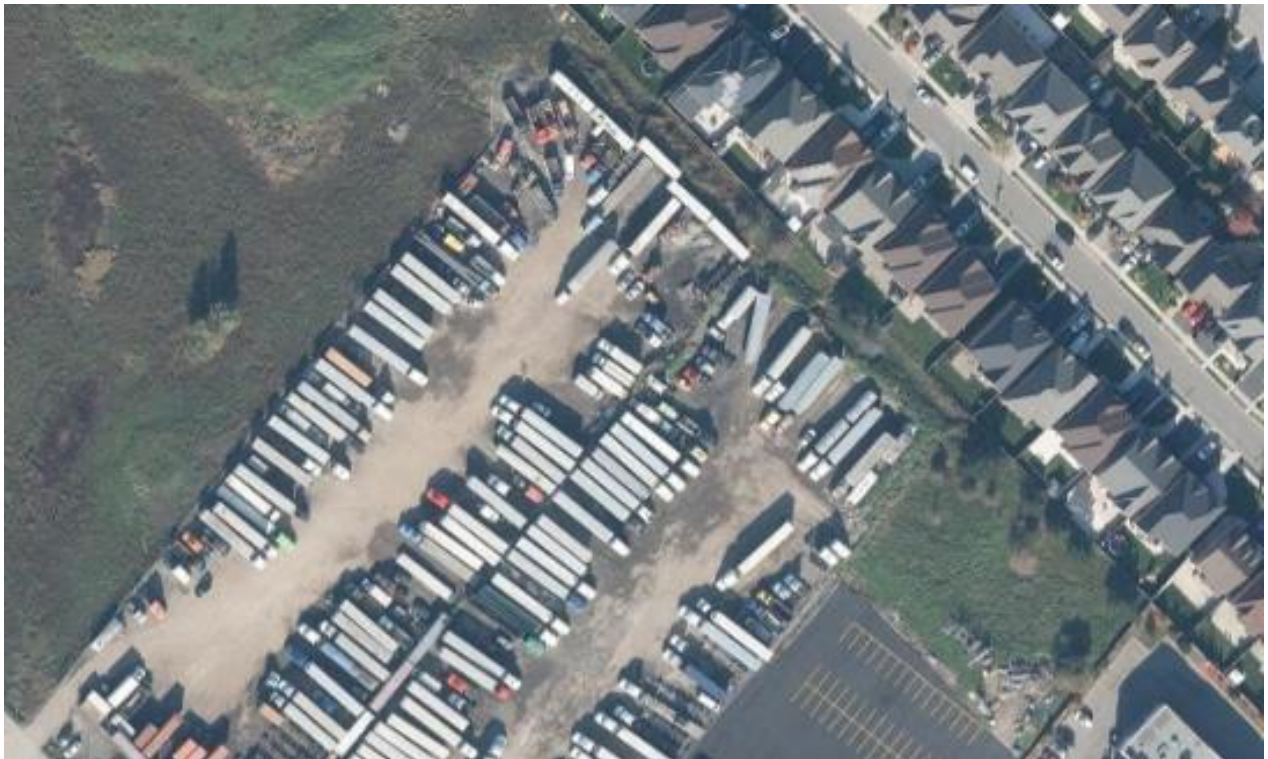
6 Zoned Industrial (2023)