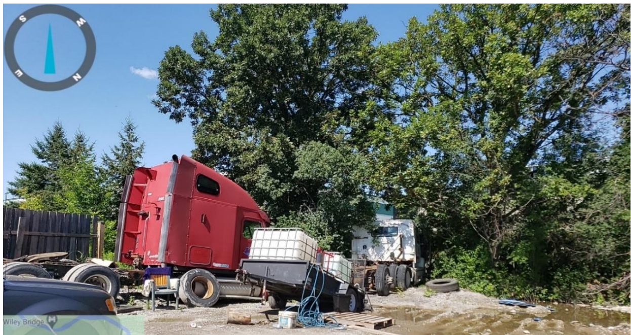
13- Unsightly storage