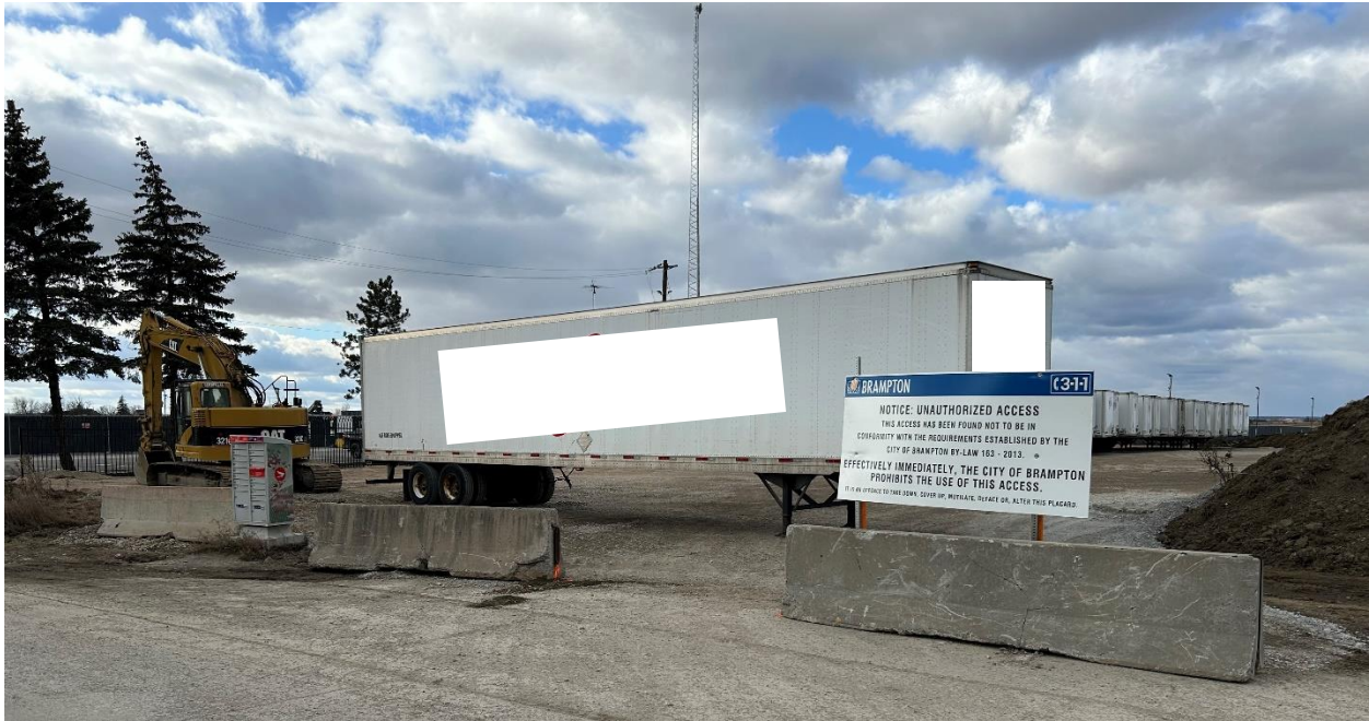
19 Work performed on City Right-of-way to create truck entrance (no permit)