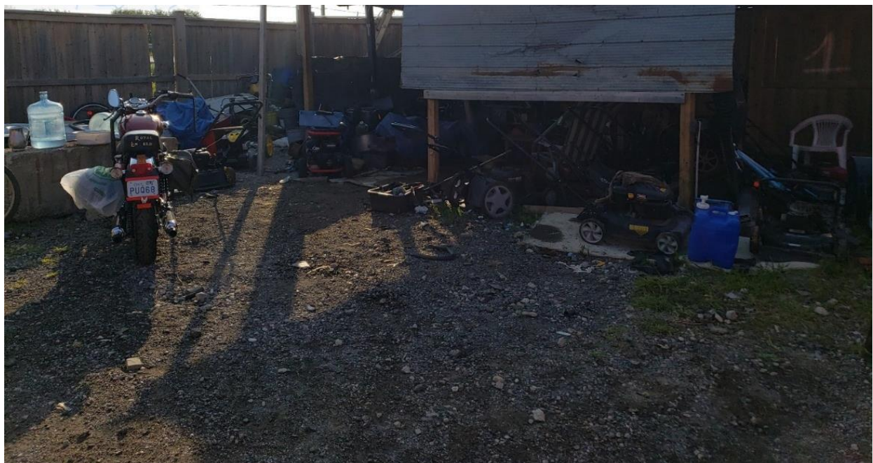
14- Unsightly storage