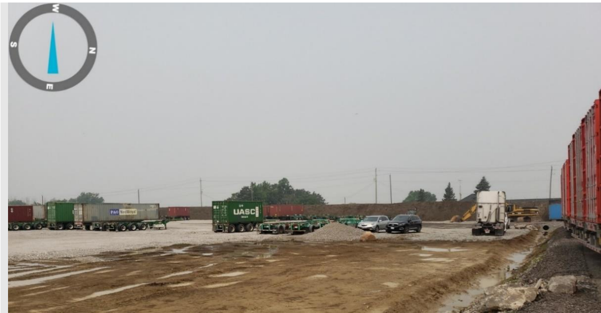
8 - Zoned Agricultural