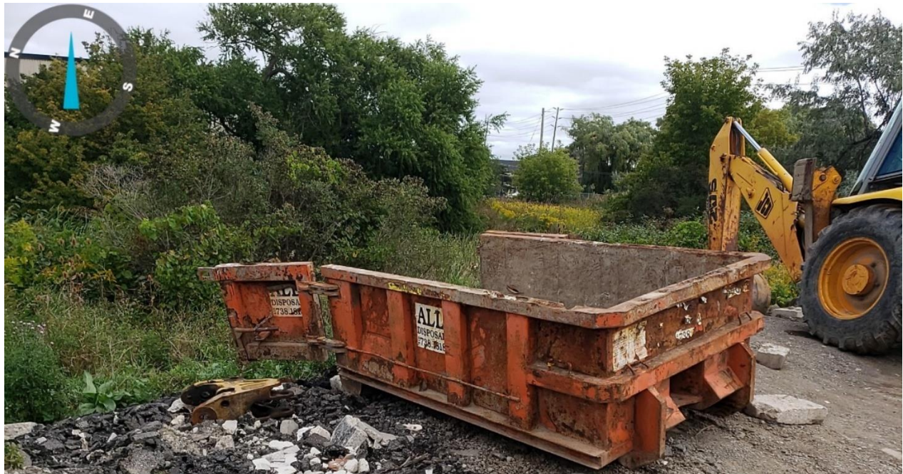
17 Encroachment and Dumping into City-owned Watercourse Corridor