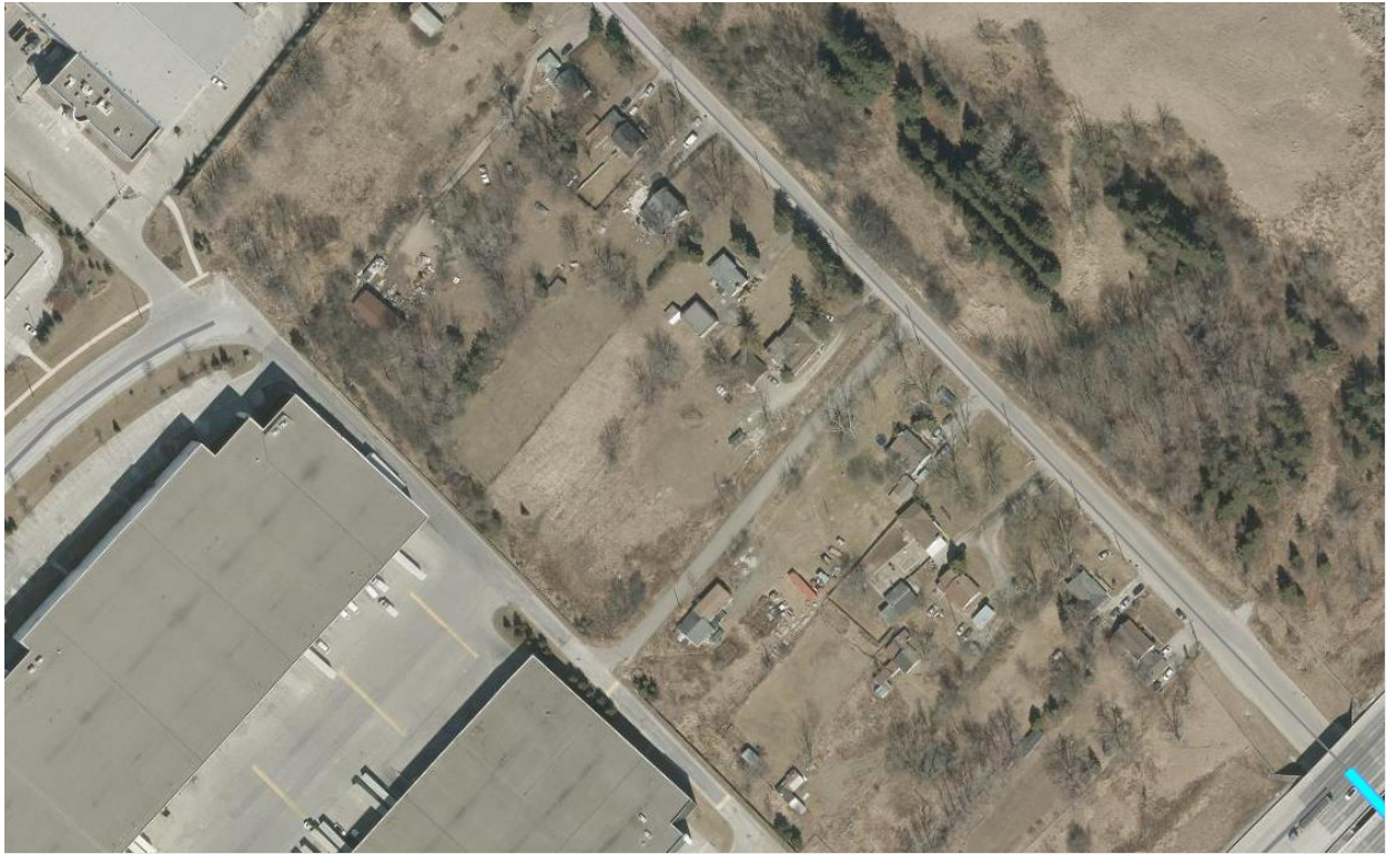
3 Zoned RE2 (2018)