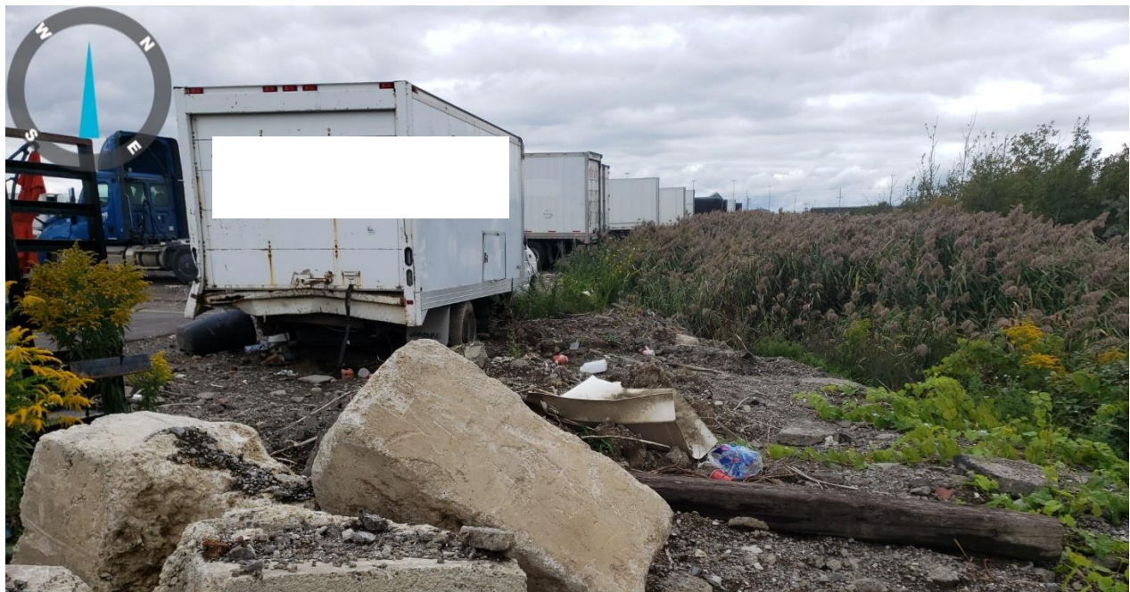
18 - Encroachment and Dumping into City-owned Watercourse Corridor