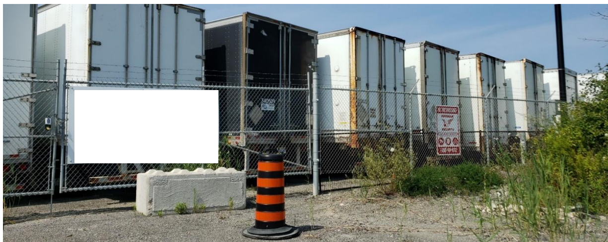
16 - Zoned Agricultural