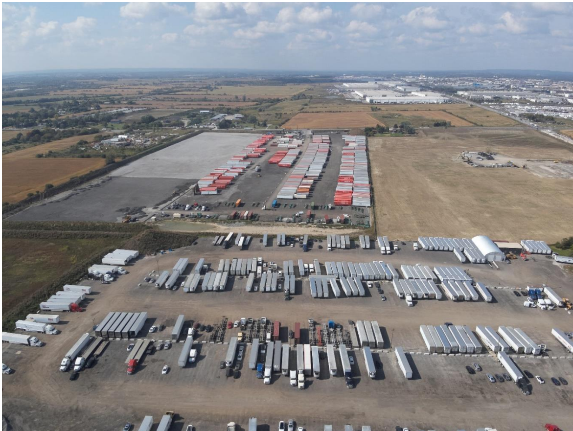
2 - Zoned Agricultural (2023)