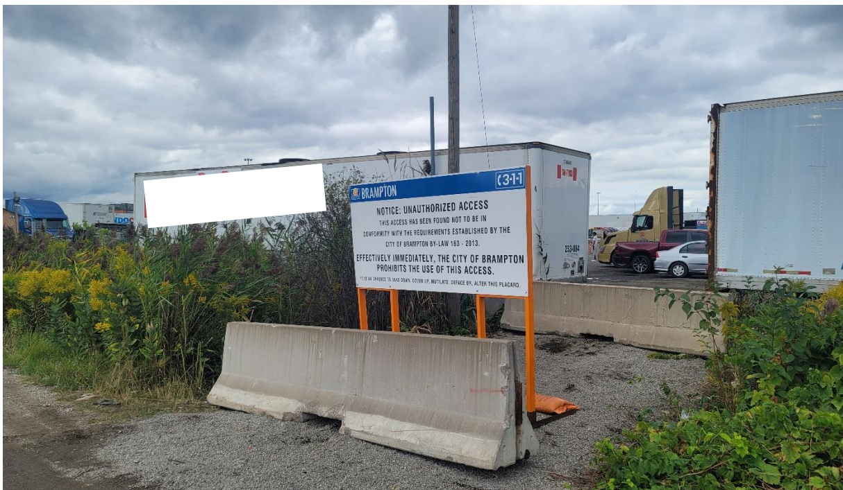
20 Works performed on City Right-of-way to create truck entrance (no permit)