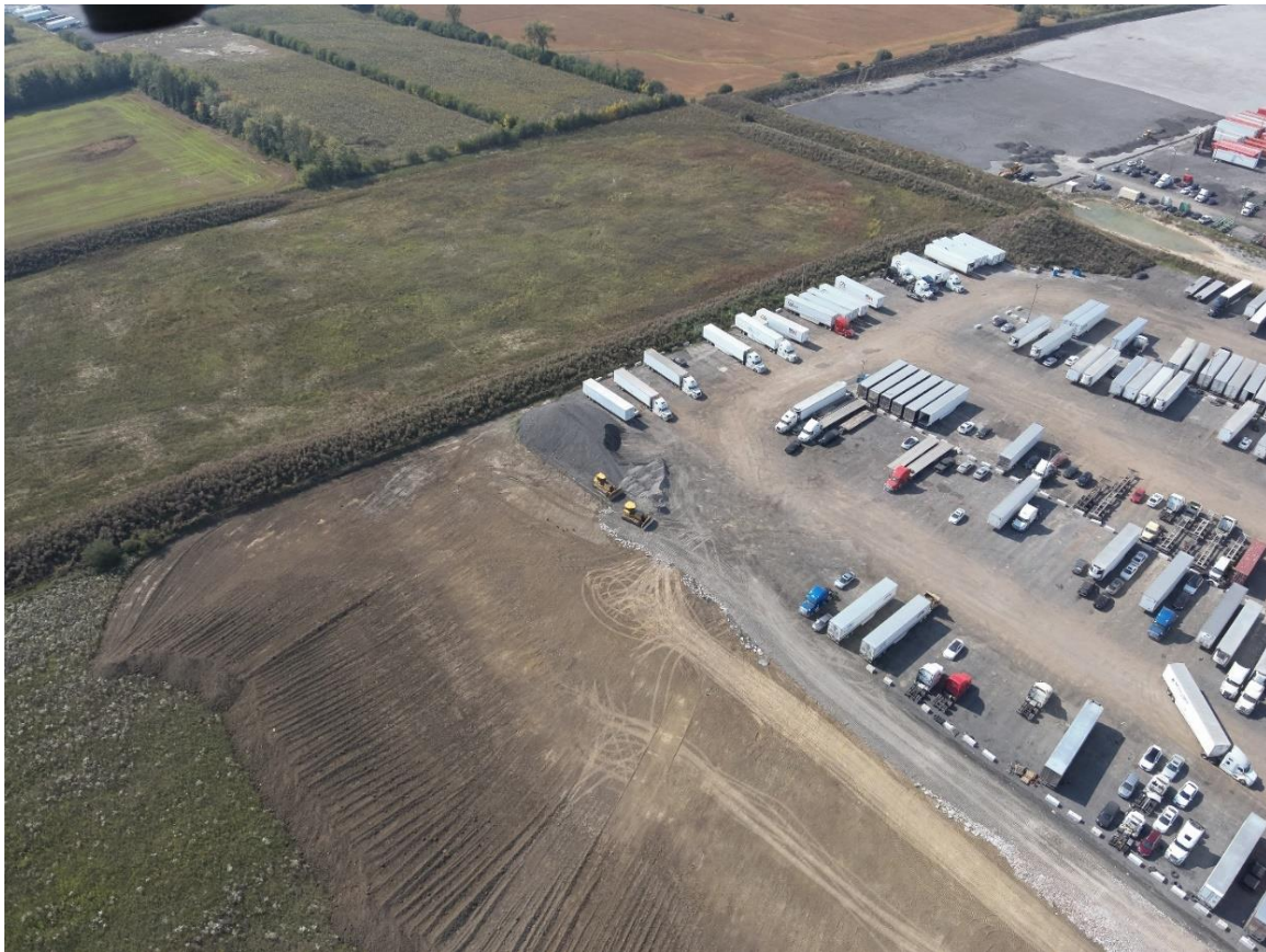
9 - Zoned Agricultural (2023)