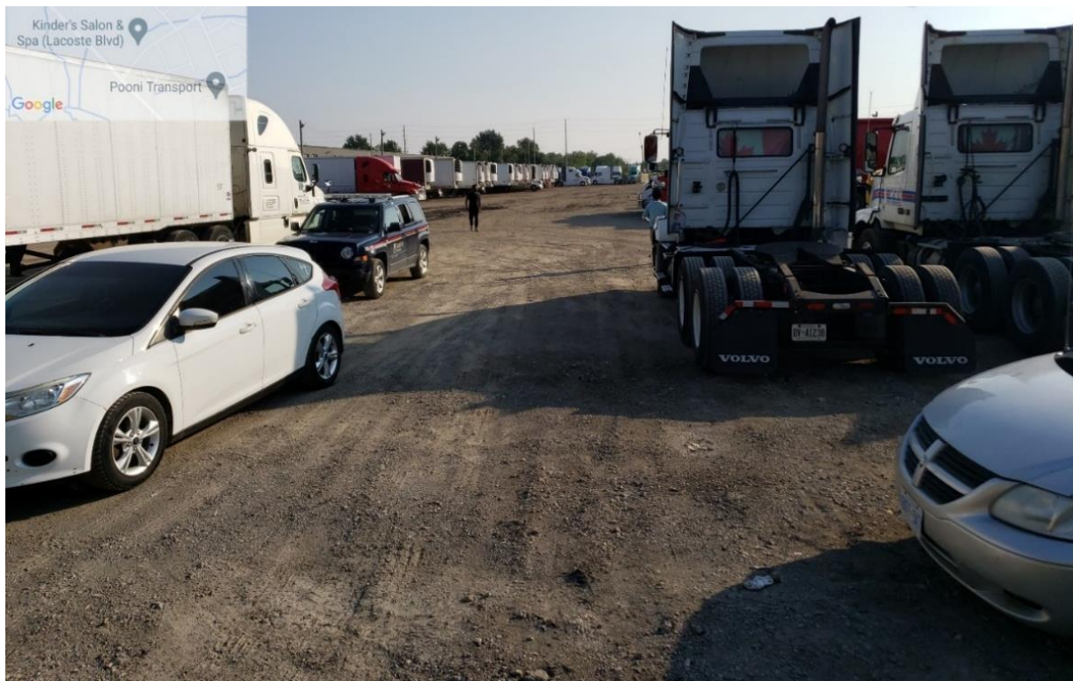
12 – Zoned Industrial, use not permitted – No site plan approval.