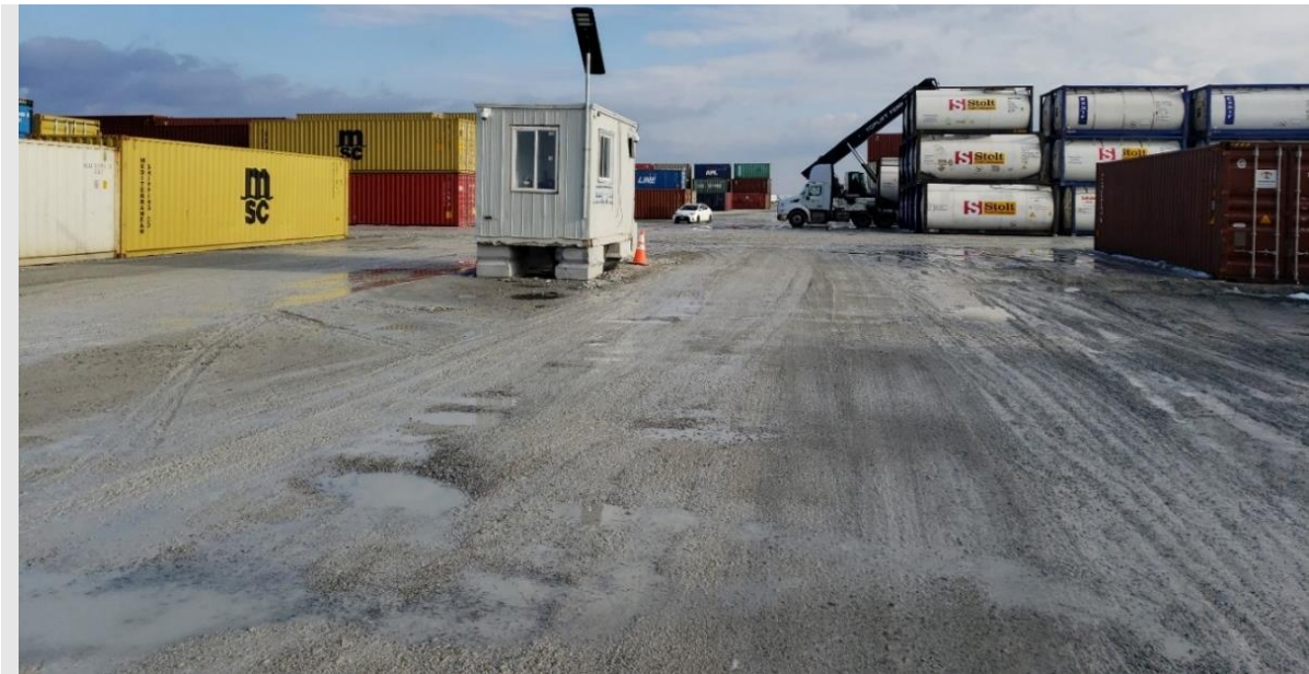
7 - Zoned Agricultural