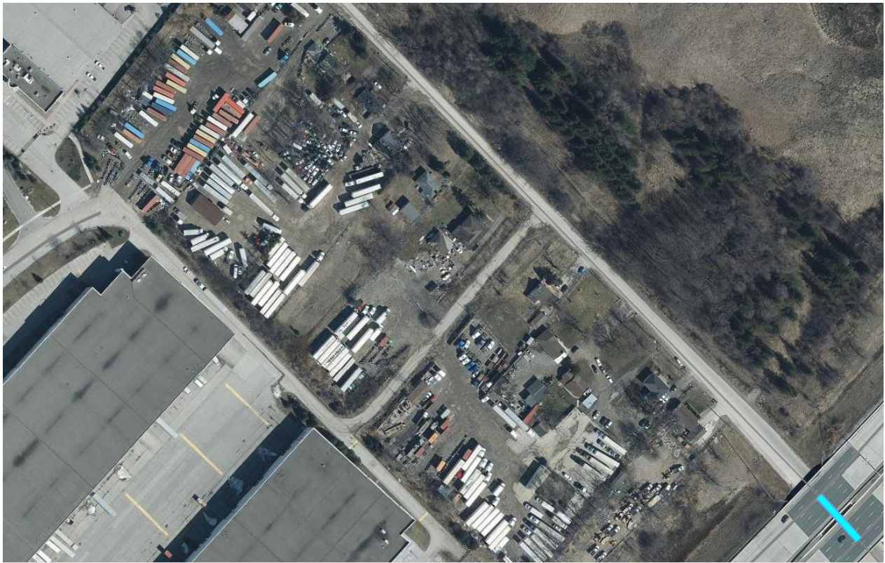
4 Zoned RE2 (2023)