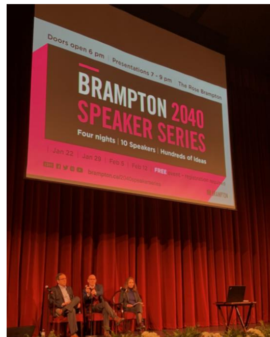
Figure 1. Brampton 2040 Plan Speakers Series

The planning framework in Ontario requires that municipalities, when making decisions that affect planning matters, shall be consistent with the Provincial Policy Statement (PPS) and conform to Provincial and Regional Plans under the Planning Act .