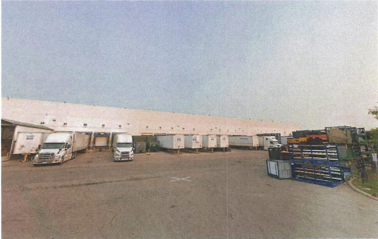
View of southern facade of subject building from Kenview Blvd.