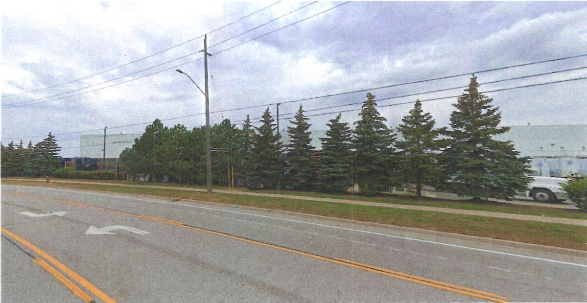
View of existing natural screening from Kenview Blvd.

Partial screening of the outside storage areas currently exists in the form of landscaping, trees and shrubbery along Kenview Boulevard, however, additional measures will be taken as per staff's direction.