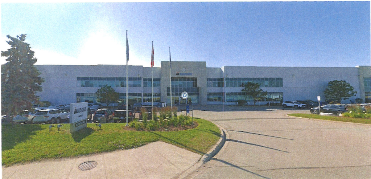
View of northern facade of subject building from Steeles Ave. E.