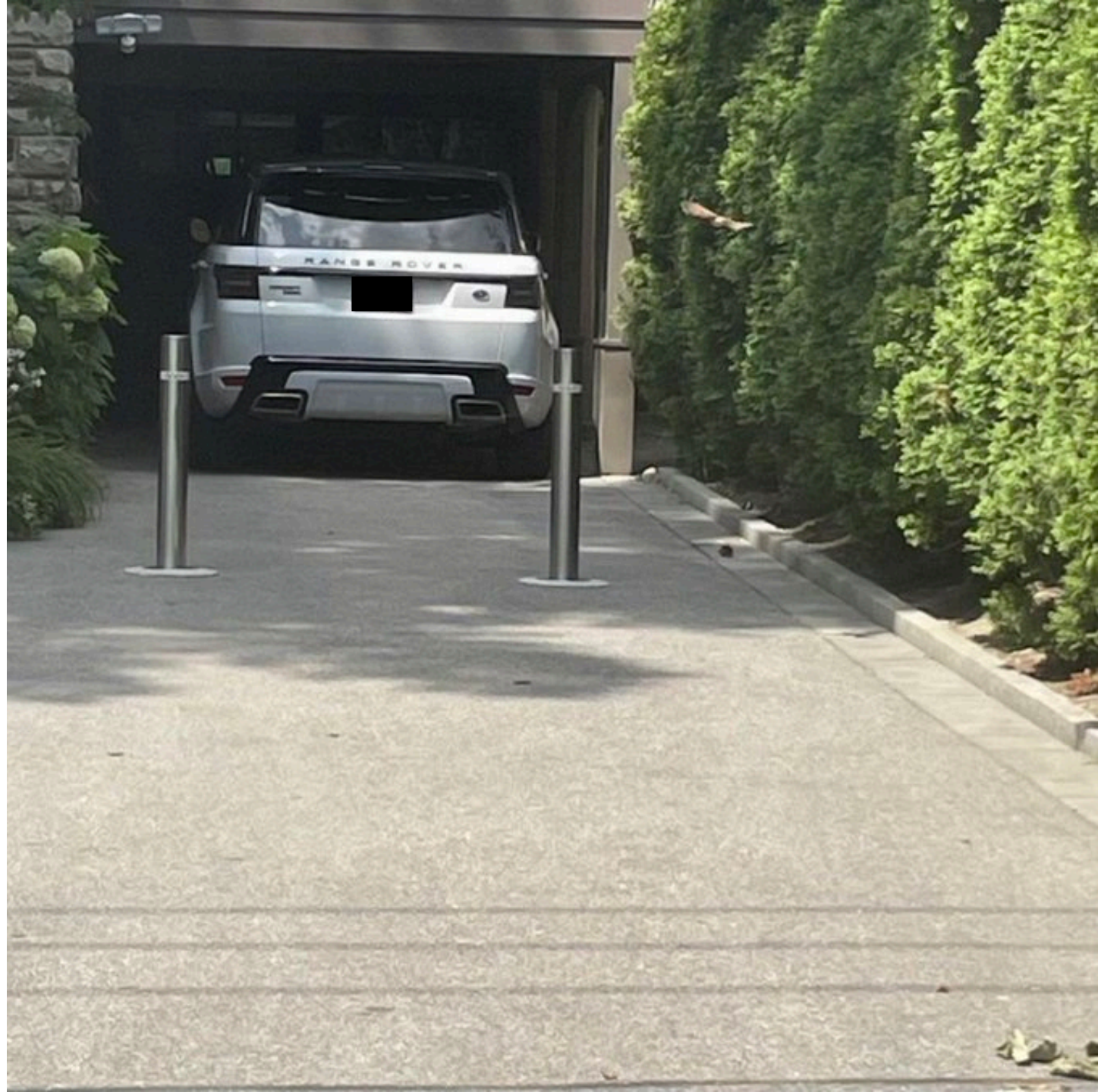
Image showcasing the practical application of an automatic bollard system, effectively safeguarding a vehicle positioned within a residential driveway. These bollards are retractable for easy access for the property owner only.