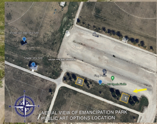
AERIAL VIEW OF EMANCIPATION PARK PUBLIC ART OPTIONS LOCATION

APPROX. MEASUREMENTS: 307.8CM/ 121 IN TALL (10FT) X 424.65CM/ 167 IN WIDE (14FT) X 111.3CM 43.8IN (3.6FT) DEPTH