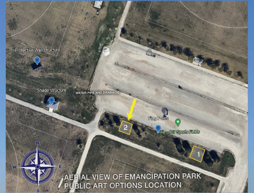
AERIAL VIEW OF EMANCIPATION PARK PUBLIC ART OPTIONS LOCATION