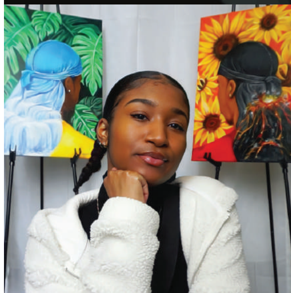
* Current draft by Jamera DaCosta - still to add other Black local - Brampton leaders of the past-present. - Flower will have different African textile patterns on it.