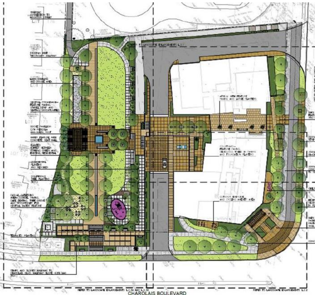
Current By-Law –green, connected, public realm space