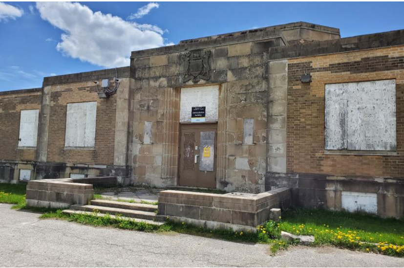
Entry porch on North facade