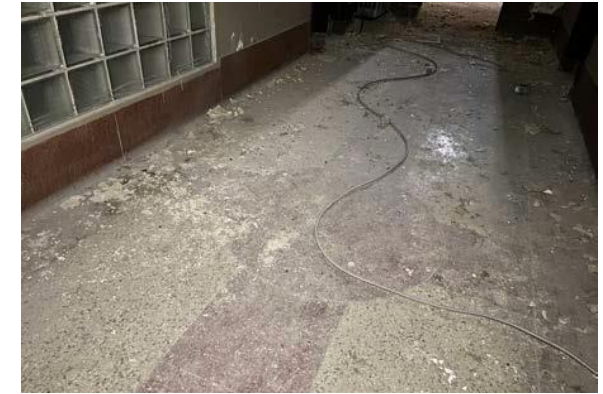
Terrazzo flooring of interior lobby