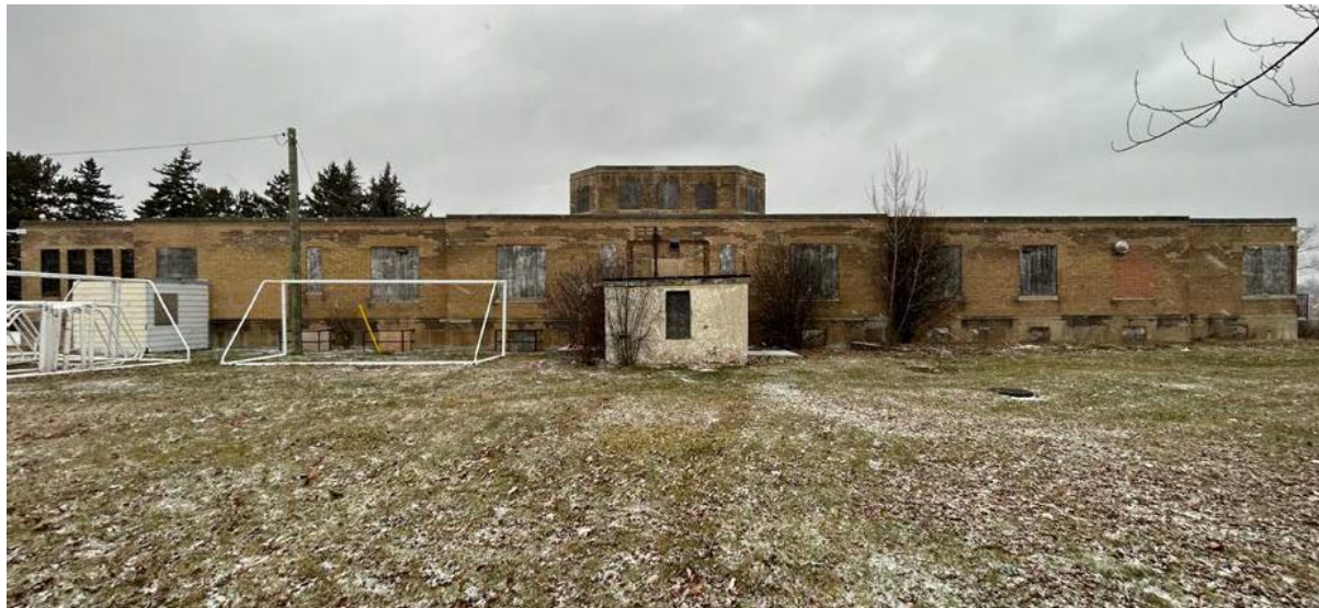
South Façade of the building