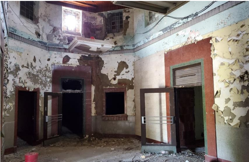
Terrazzo wall elements in interior lobby