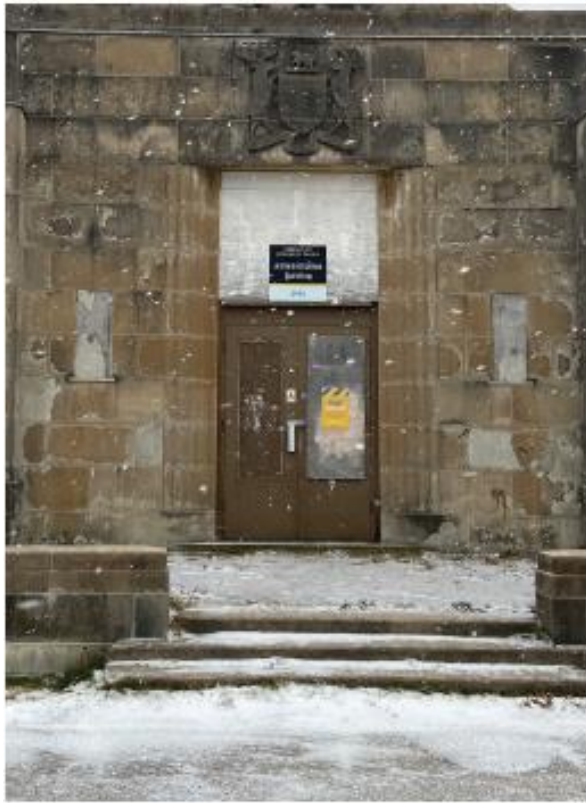
Main entrance and Coat of Arms