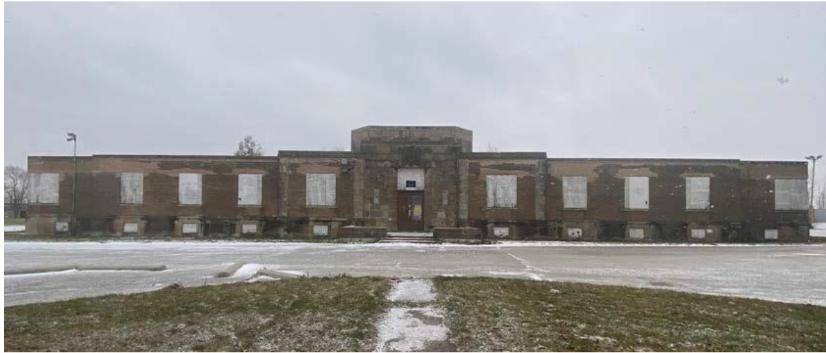
North Façade of the building