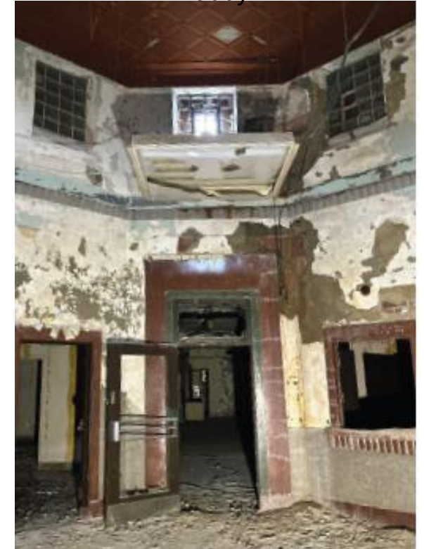
Lobby view and clerestory glass block windows