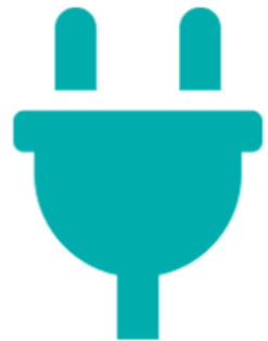
Utilities & Provincial Programs