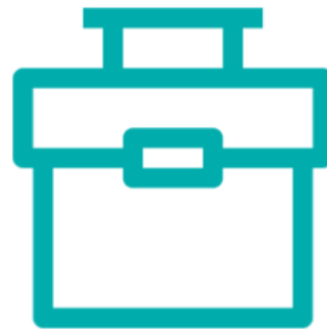
Loans & Financing