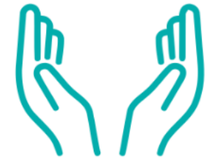
Income Qualified FREE Programs