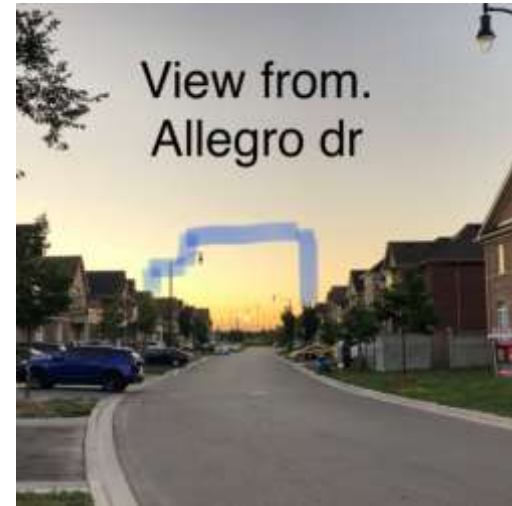
Figure3 - Sunset will be Blocked/lost to existing residents