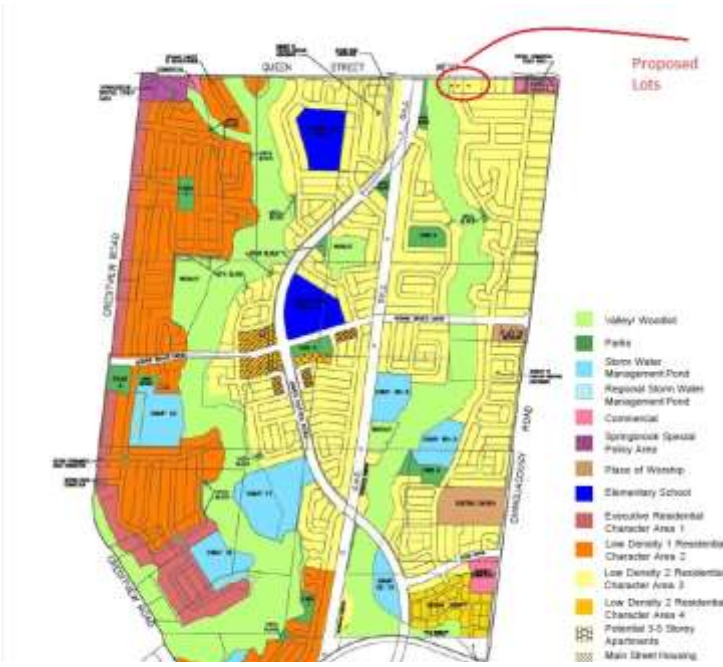
Figure 1 - community design guidelines and city file number P26SB.45-5.001 subdivision file number 21T-01100B (2008, p. 56)