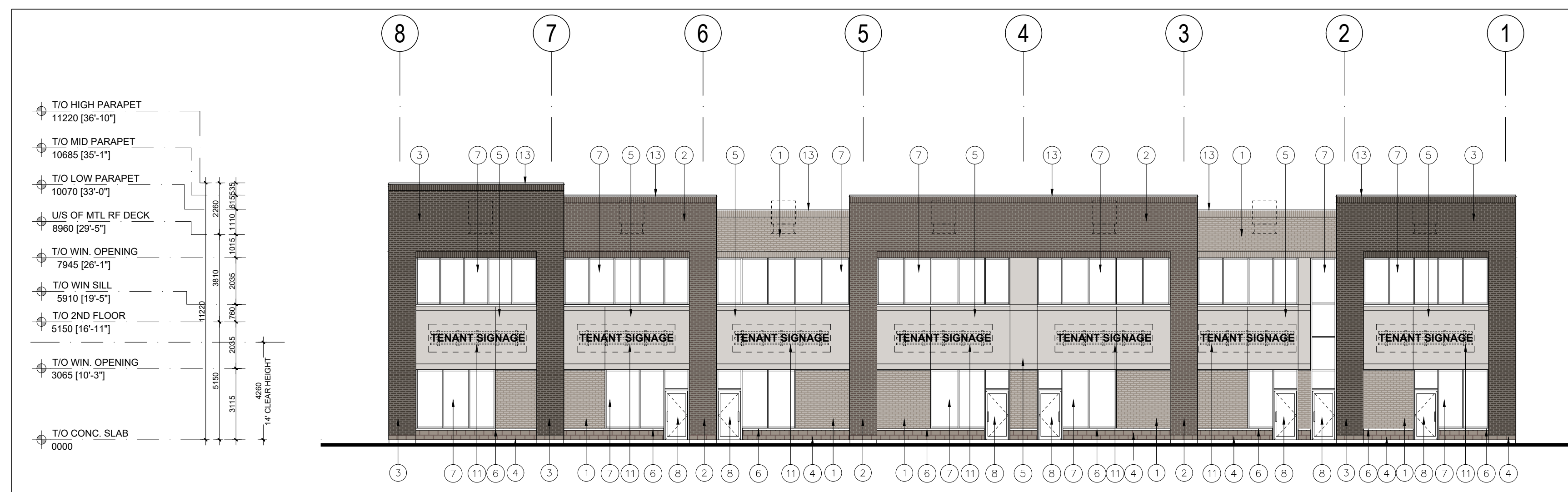
1 NORTH ELEVATION A-3.0 1:125