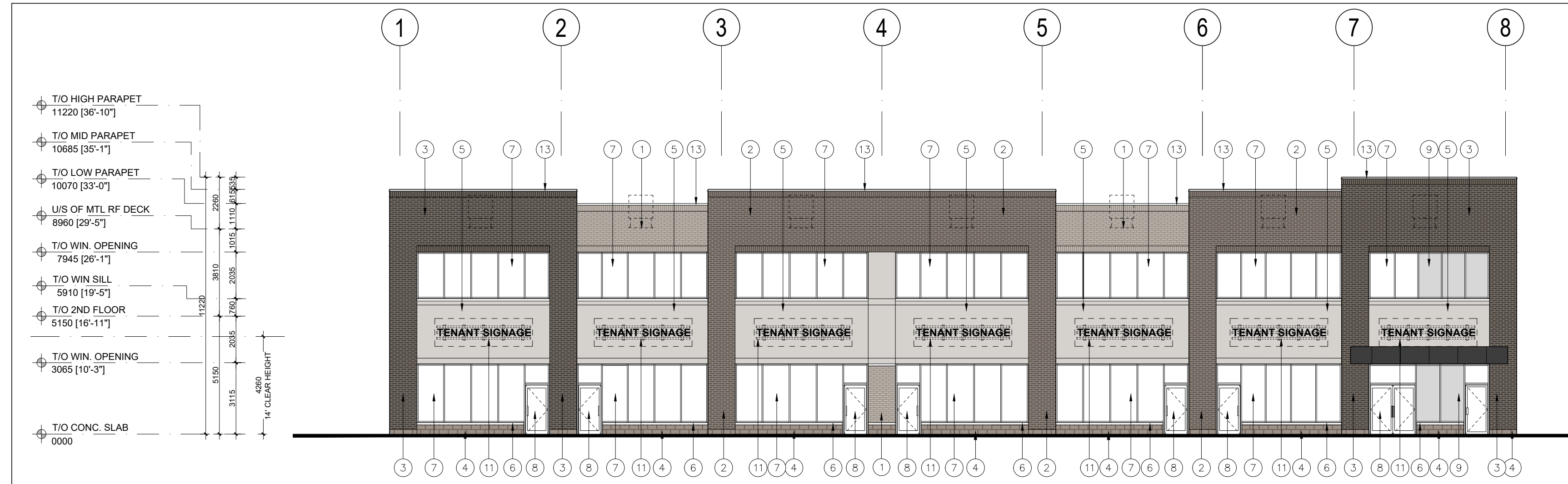
3 SOUTH ELEVATION A-3.0 1:125