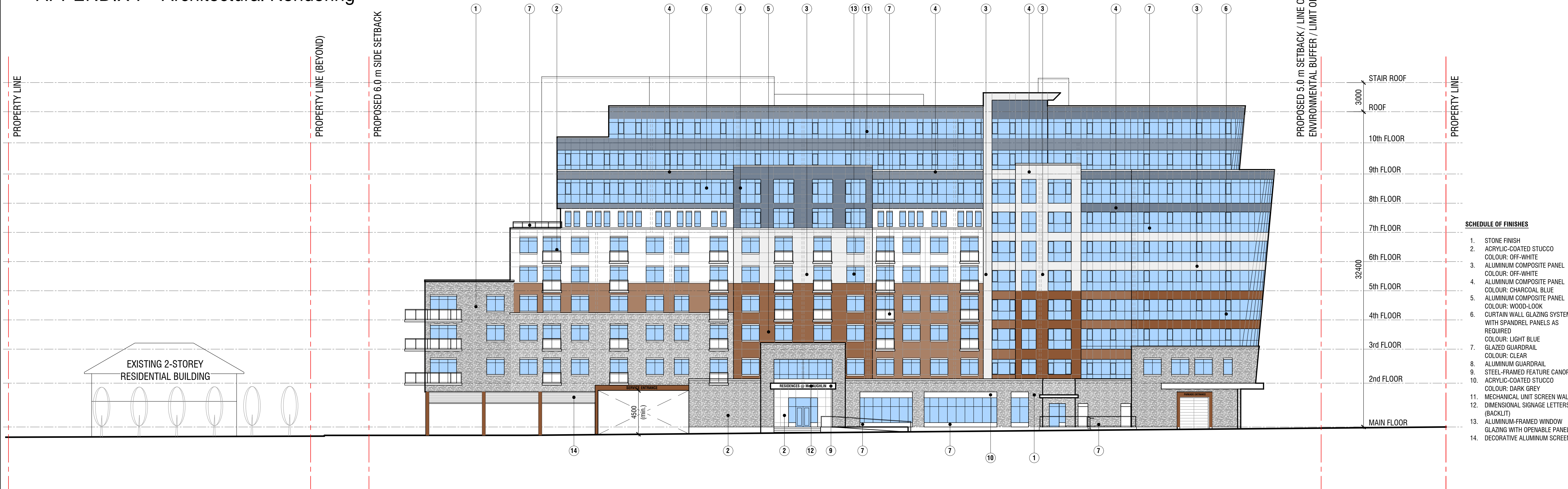
FRONT ELEVATION (McLAUGHLIN ROAD / NORTHEAST)