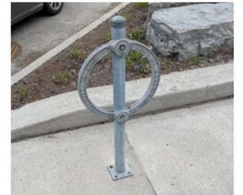
Post & Ring