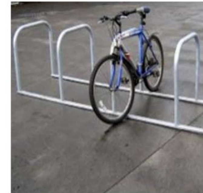
Sheffield – Multi "Toast"