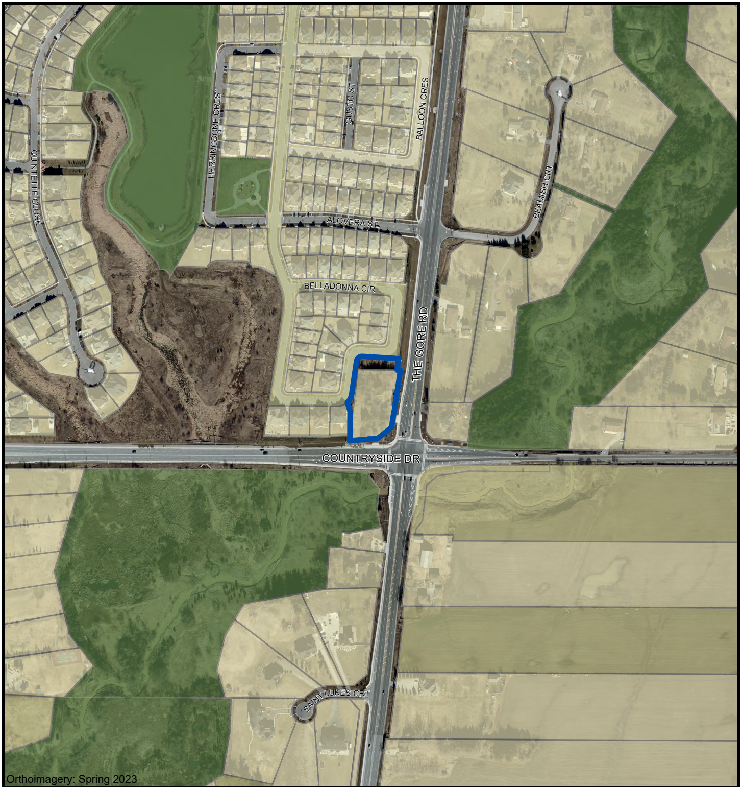
Orthomagey: Spring 2023