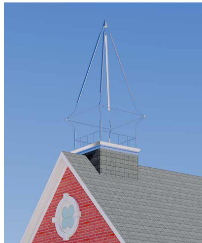
Fig. 2: Proposed commemorative 'ghost' bell tower