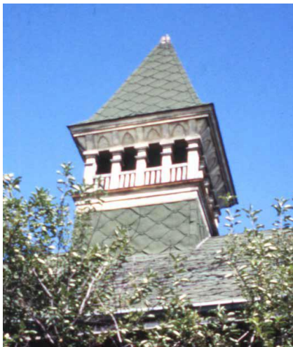
Fig. 1: Former bell tower, 1978.

Giamo Architects was retained by the owners of the property to apply for the Heritage Permit and undertake the work for the “ruinification” of the Snelgrove Baptist Church. The approved Heritage Conservation Plan (attachment 3) provides details of the measures that will be undertaken as part of the stabilization and commemorative ruinification of the building. Ruinification involves decommissioning the building, including disconnecting it from services and fully securing it so that it can continue to stand as a monument. The strategy also includes an abstract interpretation of the former bell tower in the form of a metal frame structure and a lighting Plan.