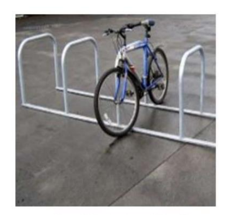
Sheffield – Multi "Toast"