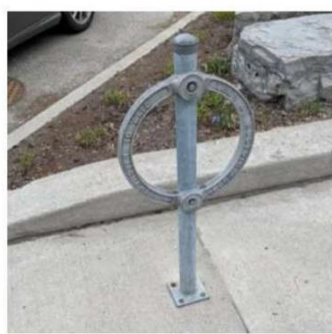
Post & Ring