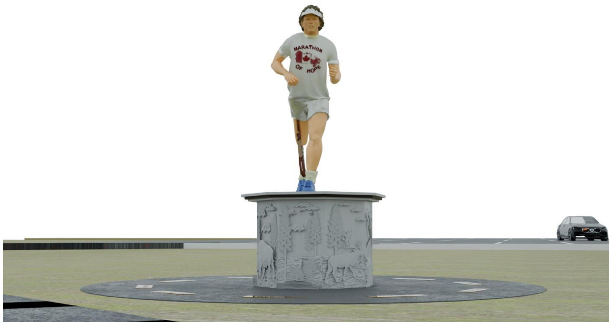
Figure 1 Frontal view of the Terry Fox Memorial

The artwork's circular asphalt pathway, embedded with commemorative bronze plaques, will be seamlessly connected to the walking path at Chinguacousy Park, ensuring accessibility. It will be accompanied by an interpretive panel (or panels) sharing educational information about Fox's journey, with a particular focus on his run through Brampton.