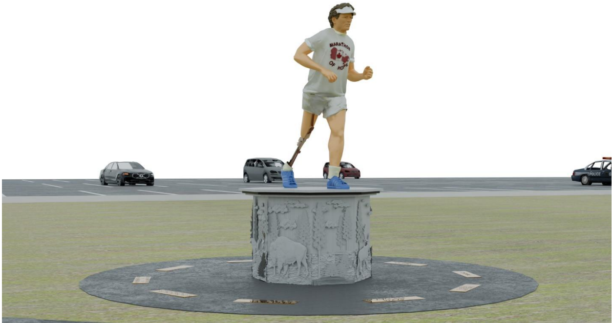
Figure 2 Three-quarter view (right-side angle) of the Terry Fox Memorial