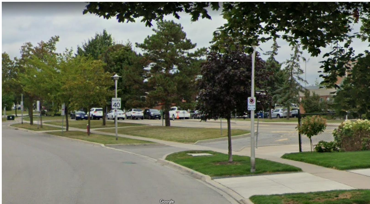
All signage in place on Goldcrest Rd., in front of the school