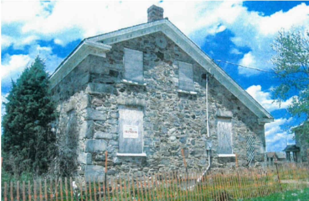
West façade of Breadner House prior to demolition (City of Brampton 2009)

Heritage attributes for the house included in the designation By-Law: