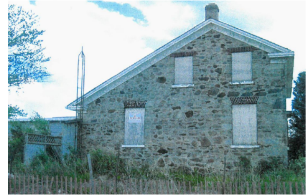
South end wall (City of Brampton 2009)