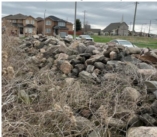
Condition of Salvaged building material on site