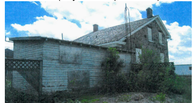
North and east façade of Breadner House prior to demolition