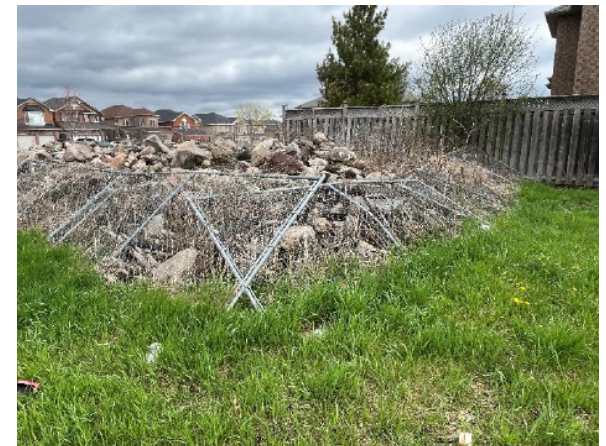
Collapsed southeast corner of perimeter fence enclosing salvaged building materials