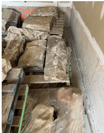
Dressed stone stored at off-site storage facility