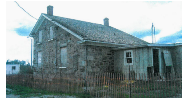
West façade of Breadner House prior to demolition (City of Brampton 2009)