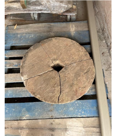
The millstone originally in the south gable