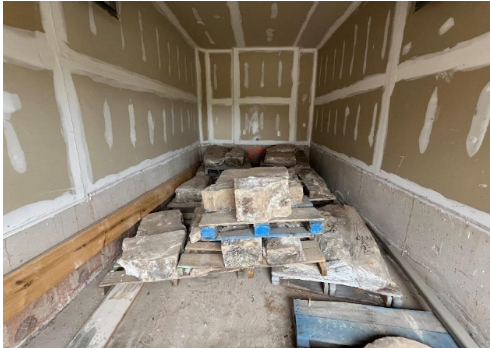
Salvaged materials stored off-site facility at 20 Tufton Crescent