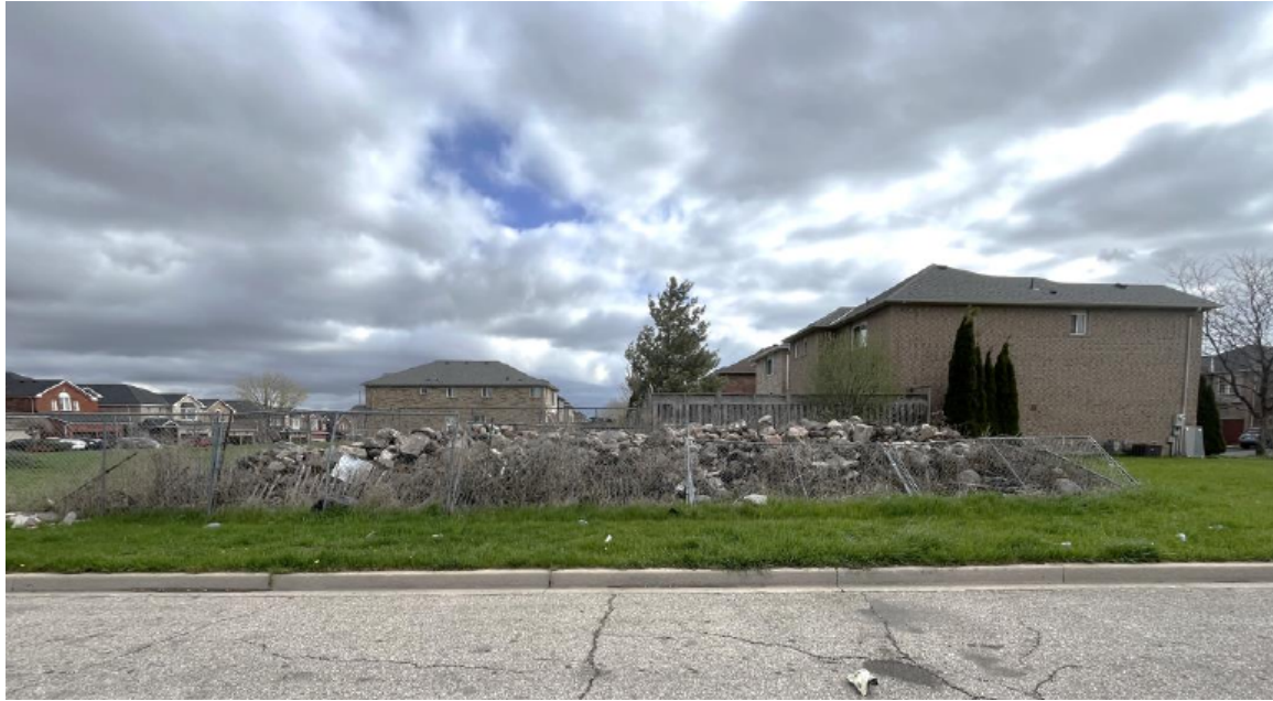
Salvaged Building material storage area on the subject property facing northeast from the public right-of-way

Actions for Monitoring and securing of the salvaged material and site is outlined in the HCP addendum: