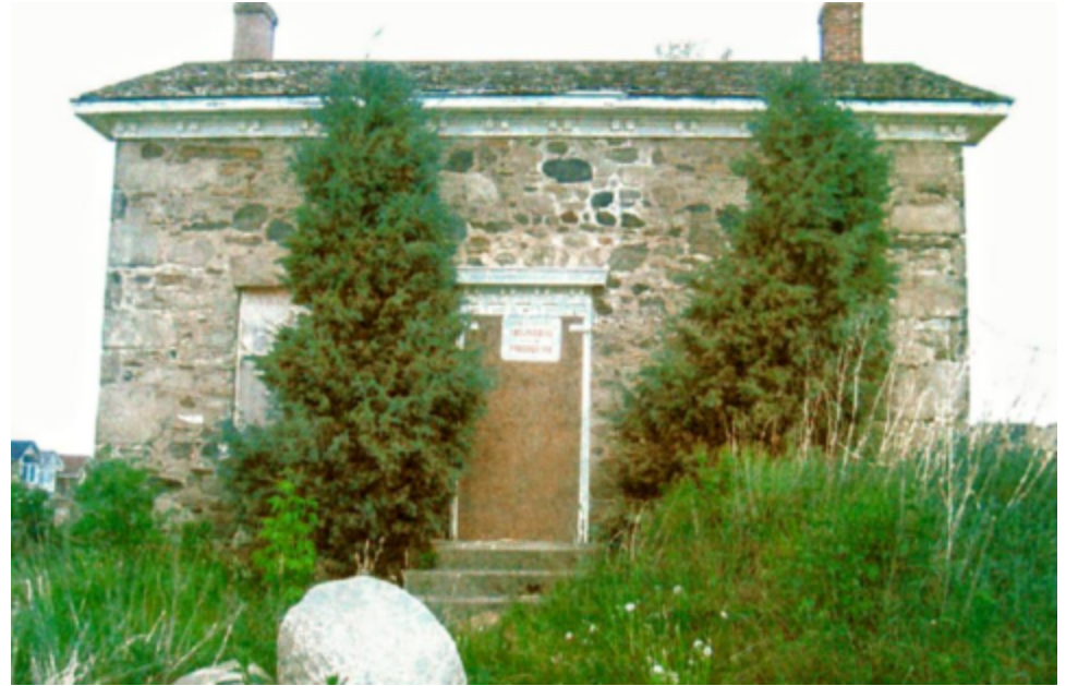
West façade of Breadner House prior to demolition

Excerpt from the City of Brampton's planning map indicating the heritage status of the subject lands, outlined with a red dashed line.