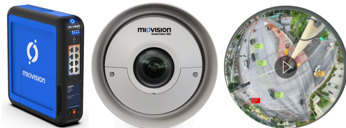
Figure 2: Miovision CORE DCM and SmartView 360 Camera System