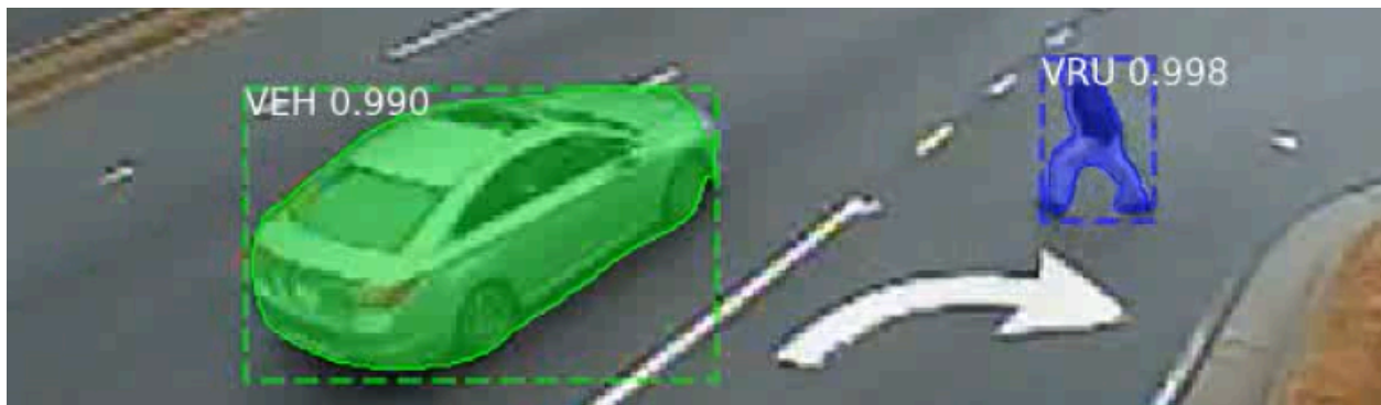
Figure 1: Miovision Automated Video-Based Conflict Analysis Tool to measure Near-Misses, also called Conflicts