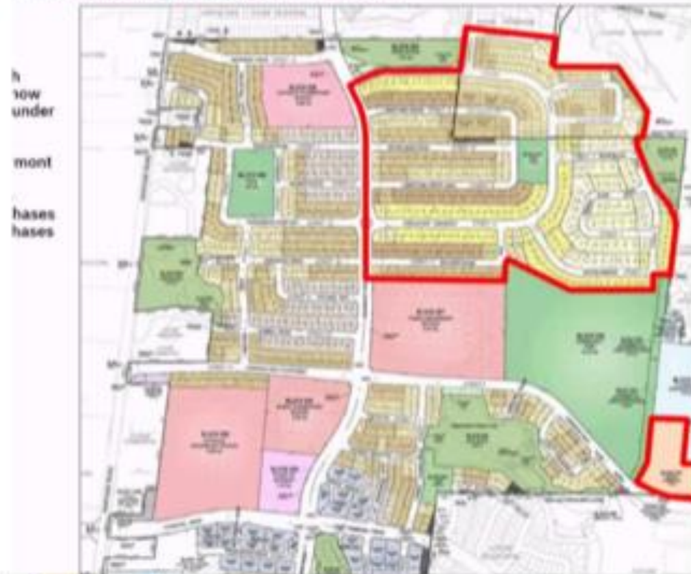
Previously Approved Plan