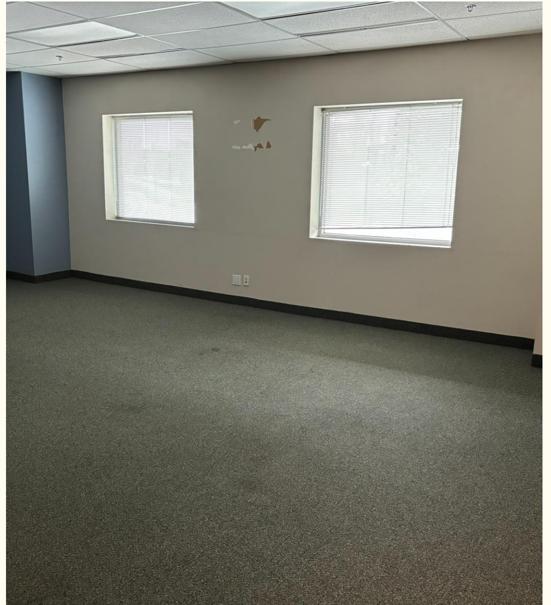
8 Nelson Street W, Vacant Second Floor