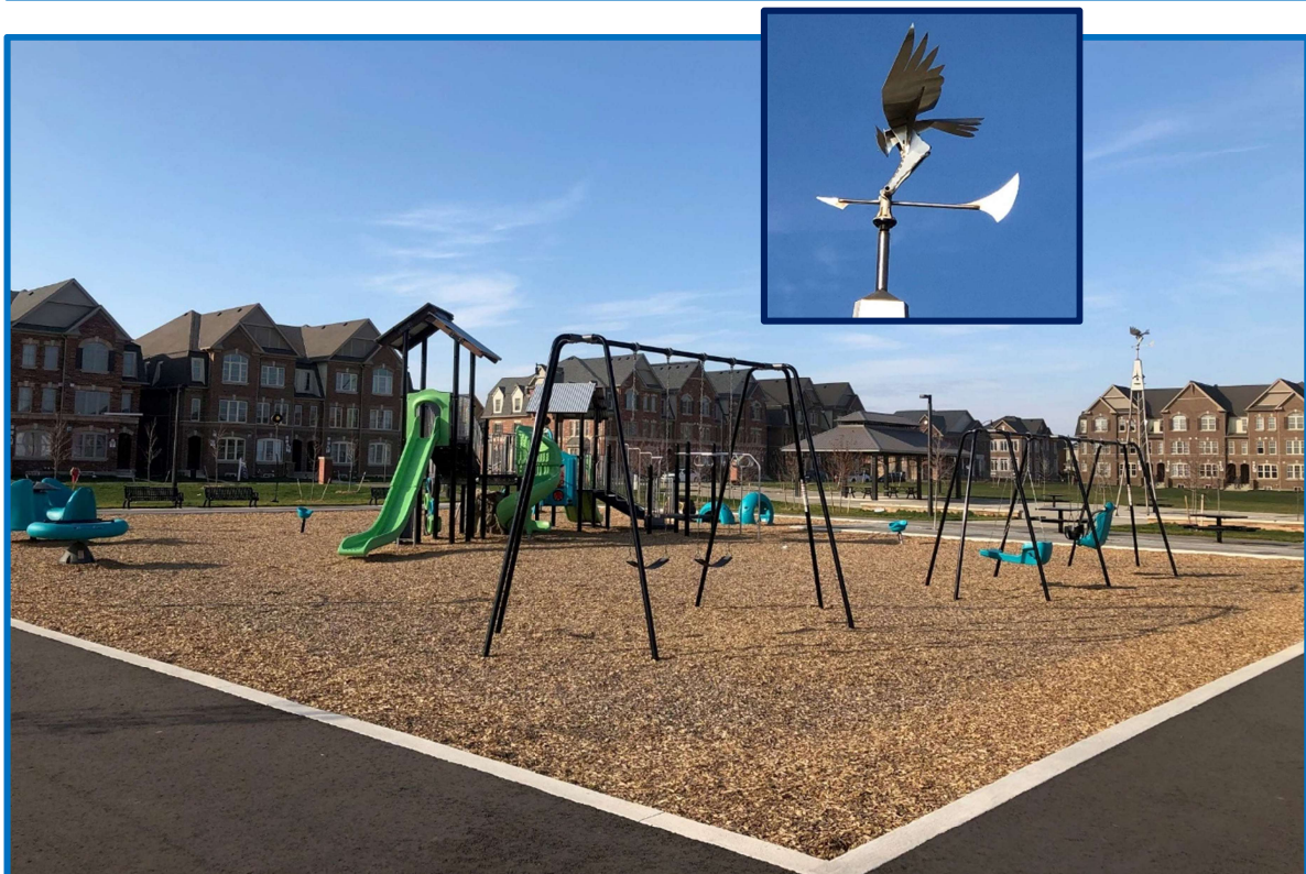
PARK BLOCK 323 PLAYGROUND AND OWL SCULPTURE (PUBLIC ART)