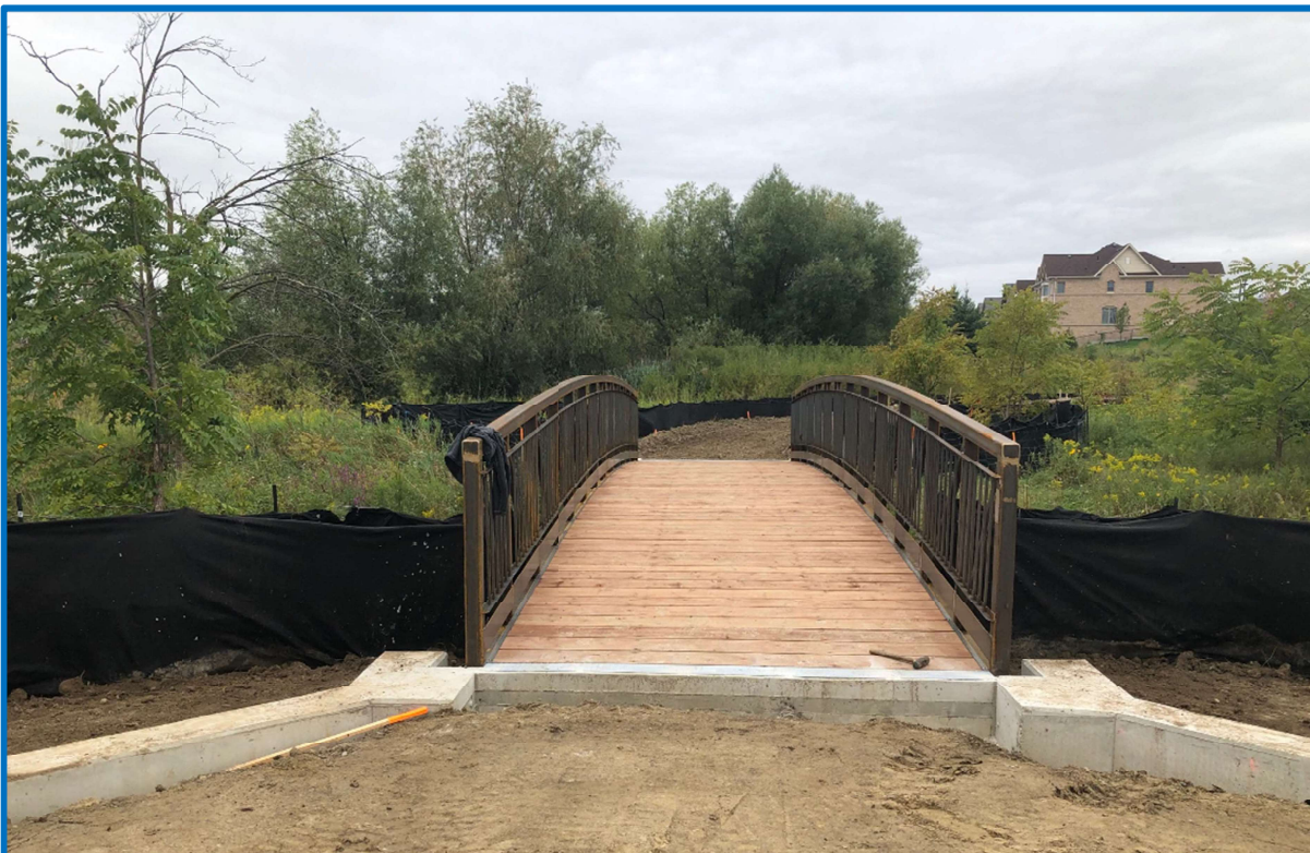
PEDESTRIAN BRIDGE UNDER CONSTRUCTION IN VALLEY BLOCK 7