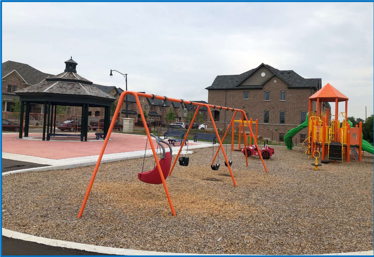
PLAYGROUND AND SHADE STRUCTURE IN PARK BLOCK 17