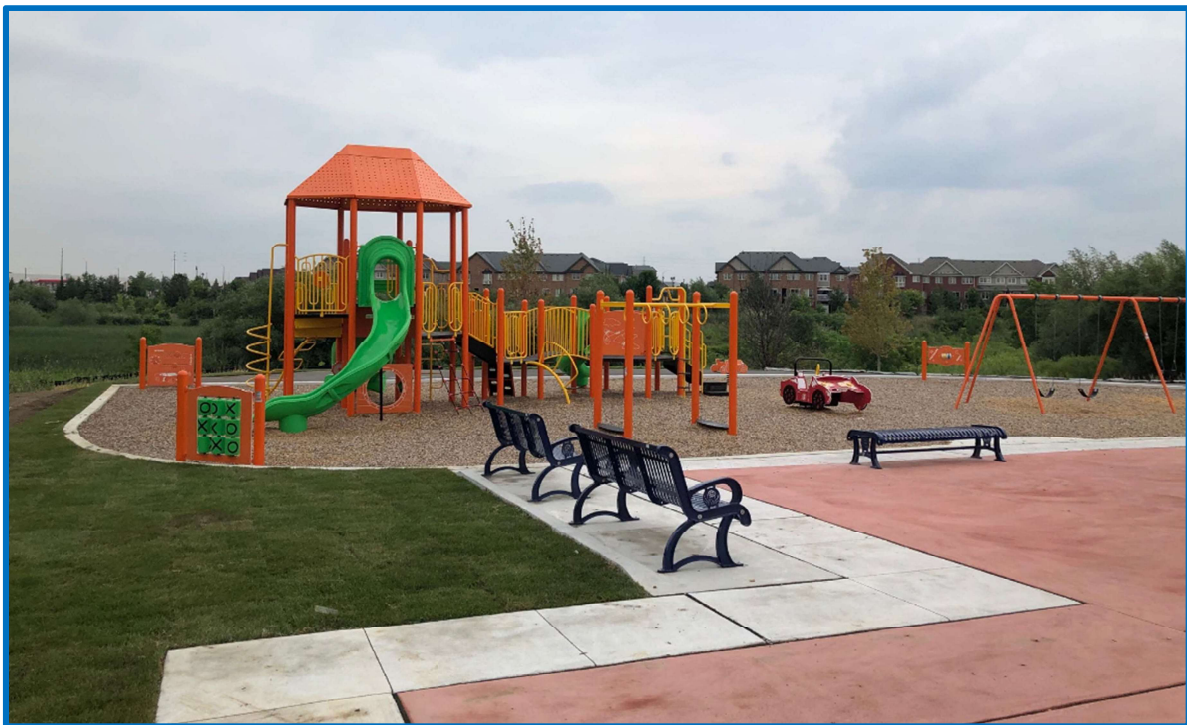
PARK BLOCK 17