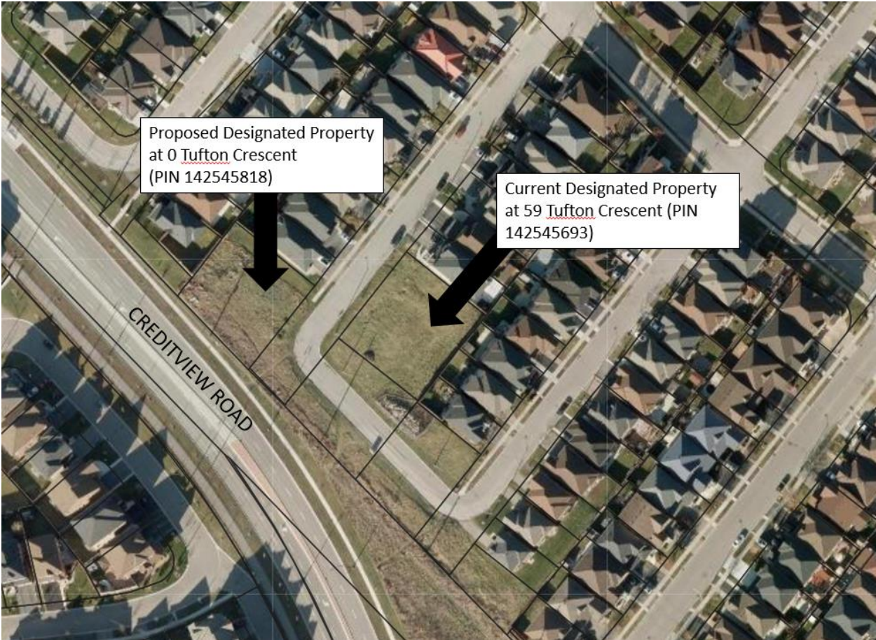
This aerial map is provided for information purposes only and is oriented with the north at the top. The exact property boundaries are not shown.