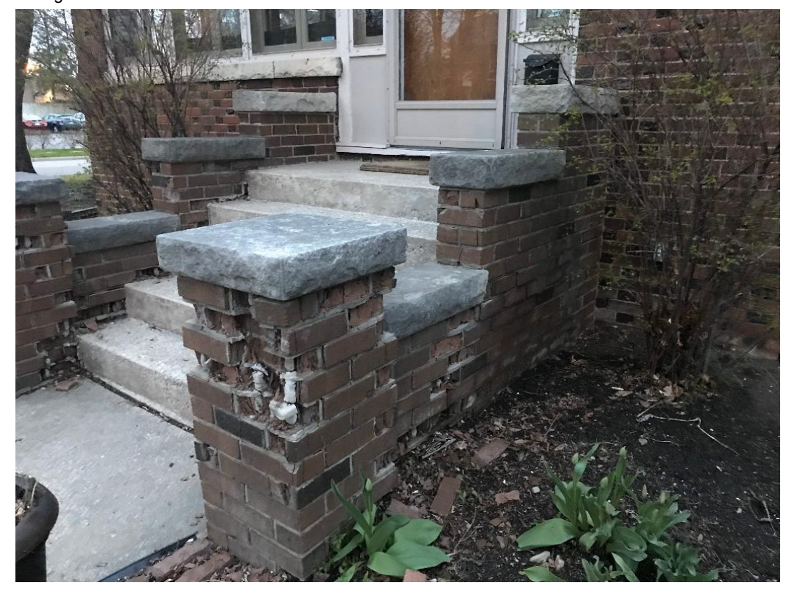
Figure 2 - current condition of kneewall beside steps at 38 Isabella Street