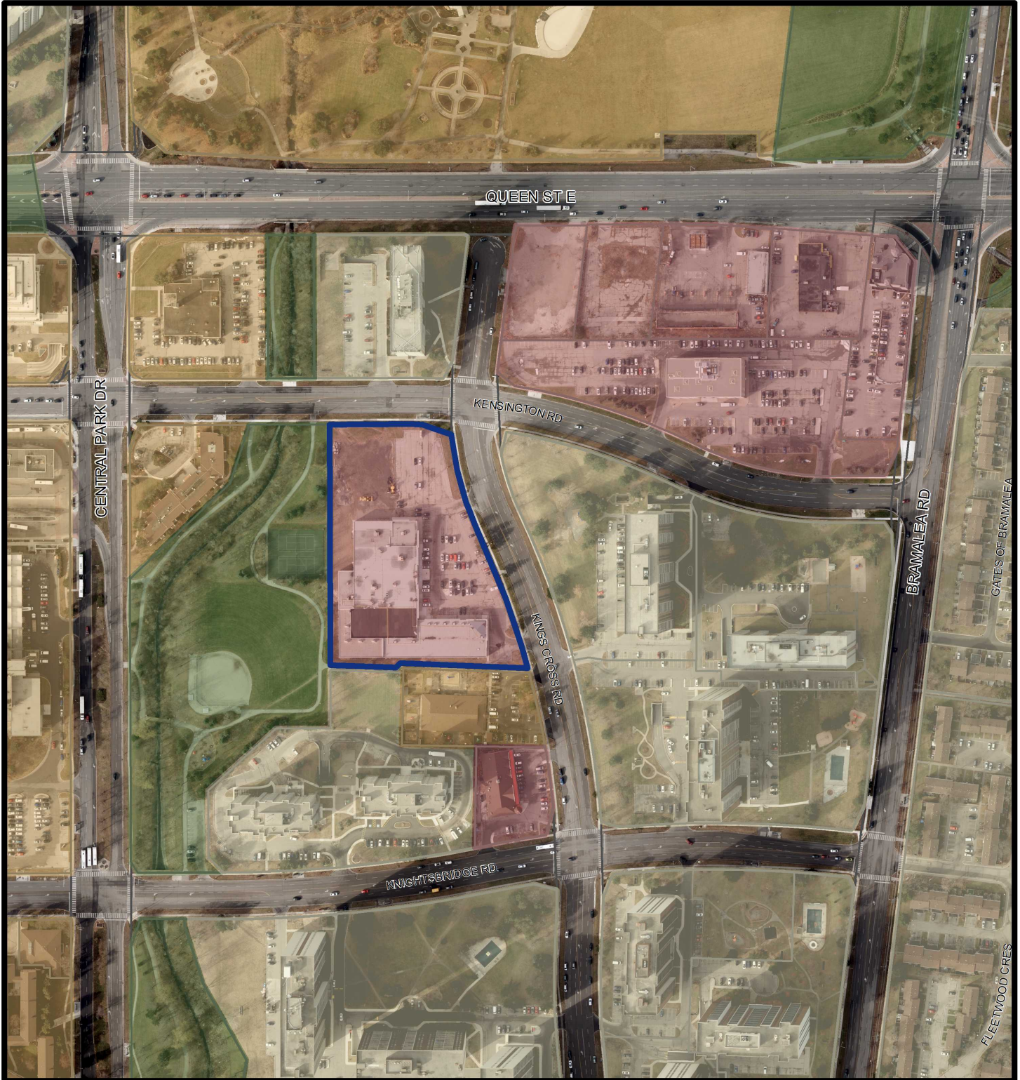
AERIAL PHOTO DATE: FALL 2018