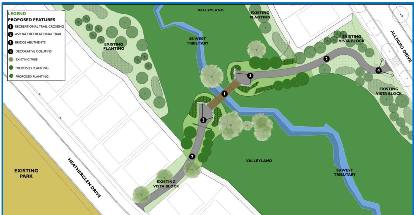
FP BLOCK Phase 2, Valley Block 154 (Plan No. 43M-1931)