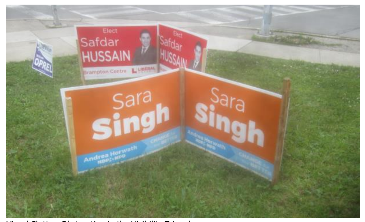
Visual Clutter, Obstruction in the Visibility Triangle