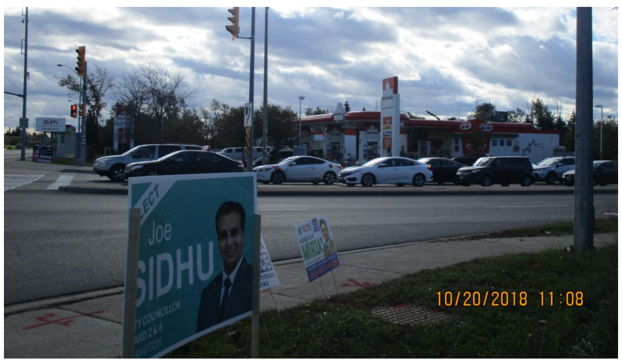
Visual Clutter, Driver and Pedestrian Distraction at intersection