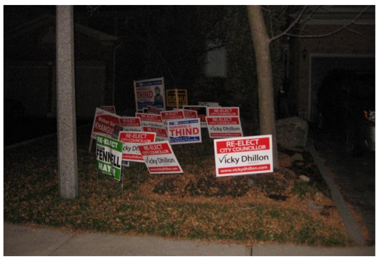
Visual Clutter and Driver Distraction