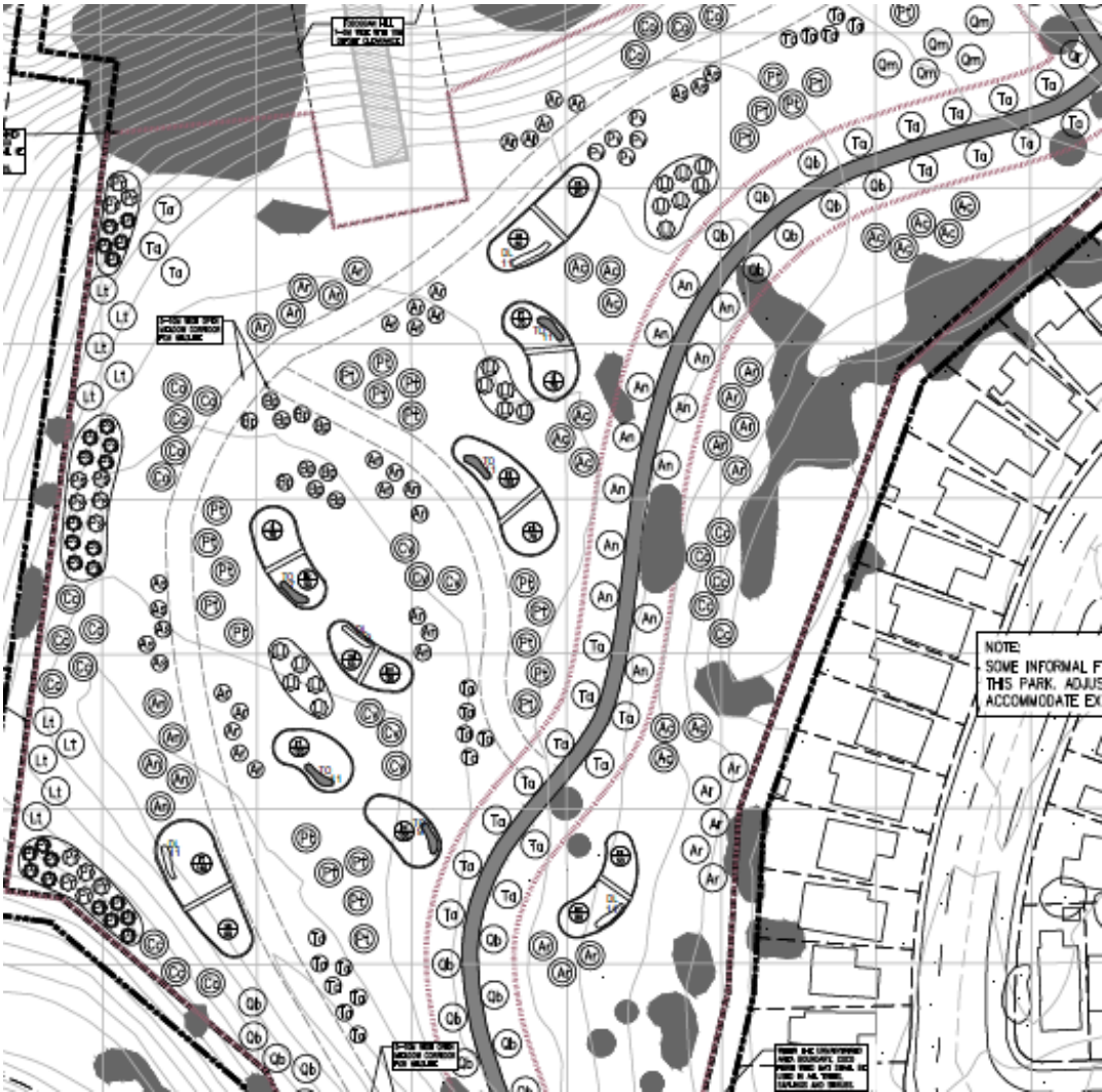
Bramalea Ltd. Community Park Design Drawings, 2020