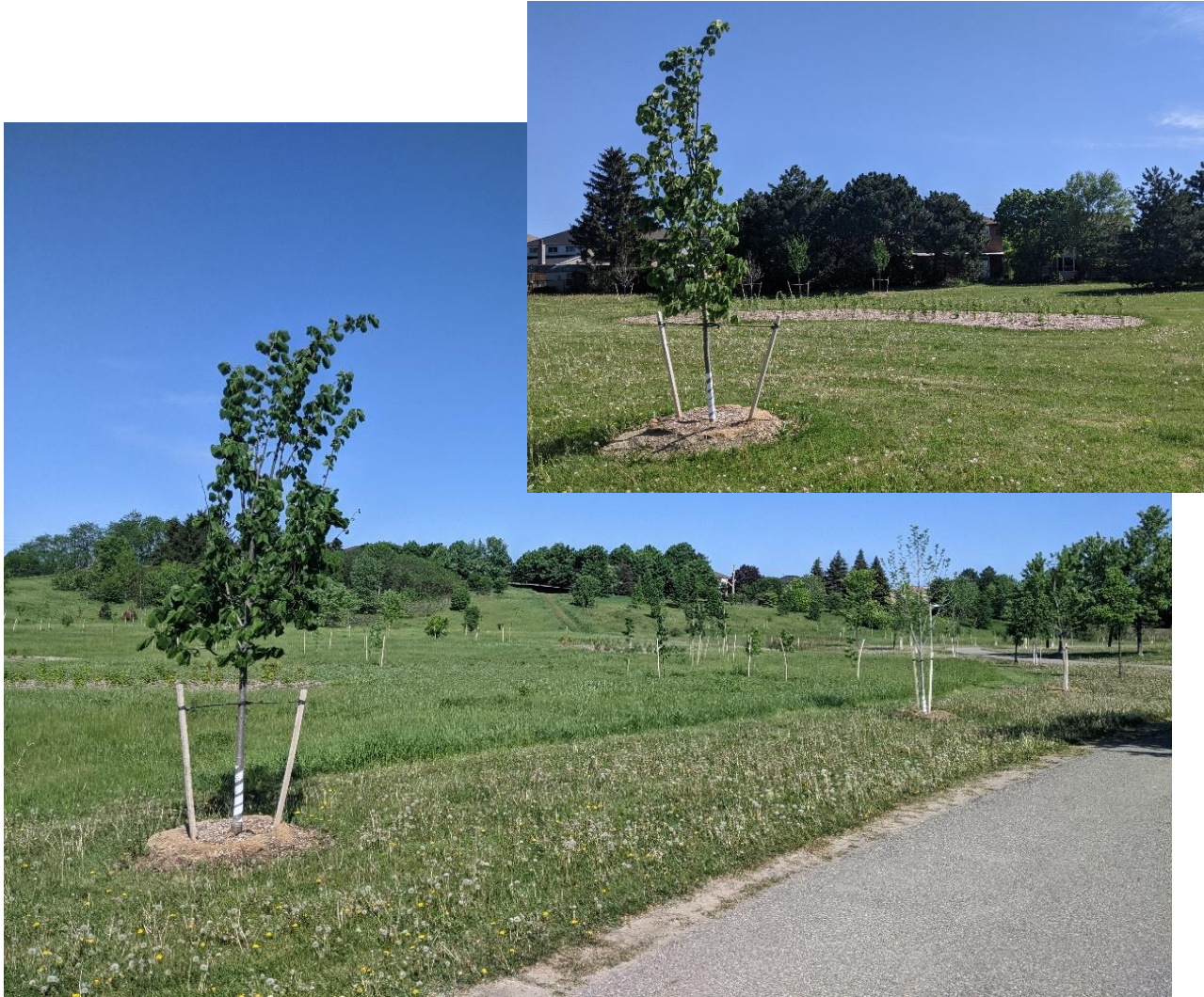
Bramalea Ltd. Community Park, May 2021