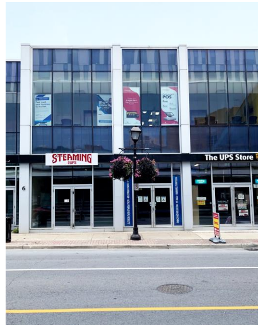
RIC Centre (top floor)