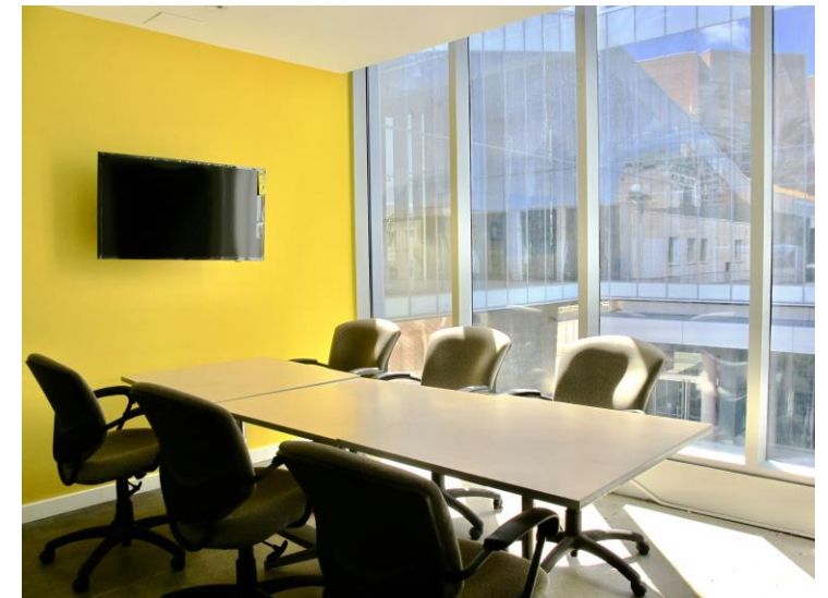
2 Meeting Rooms