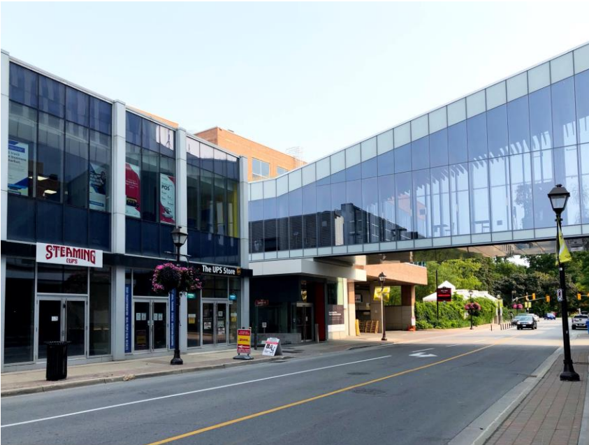
RIC Centre & Ryerson Cybersecure Catalyst