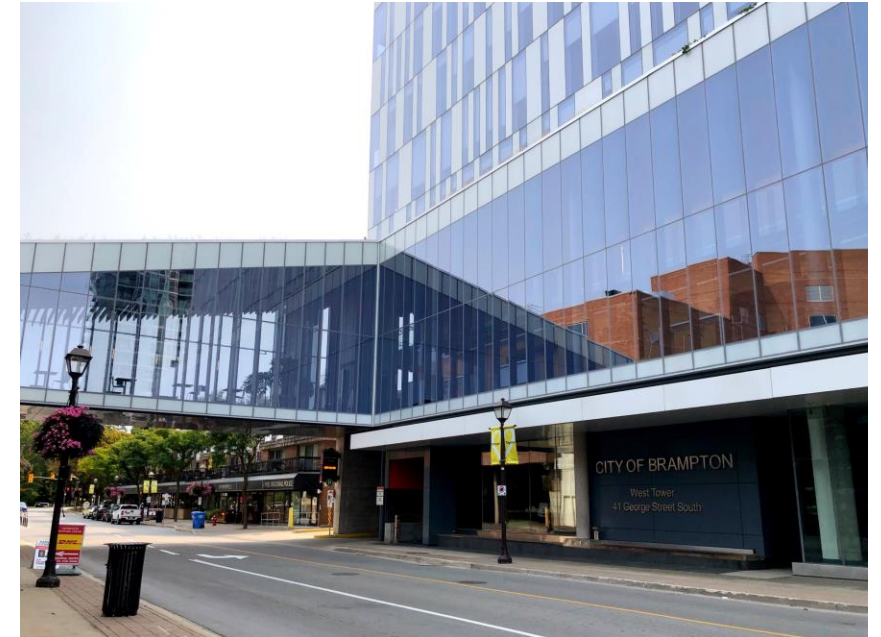
City Hall & Brampton Entrepreneur Centre