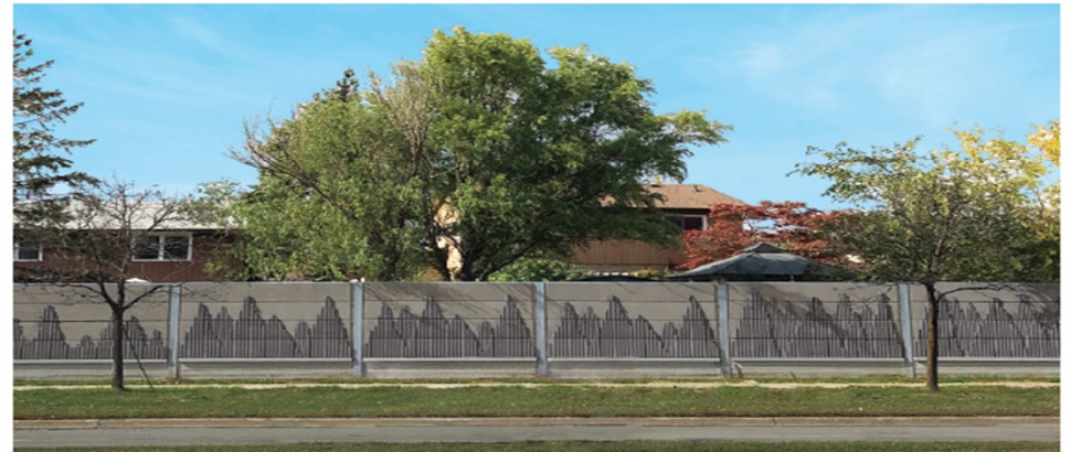
Option 3: medium-tone, warm grey background and darker-tone, neutral grey trees