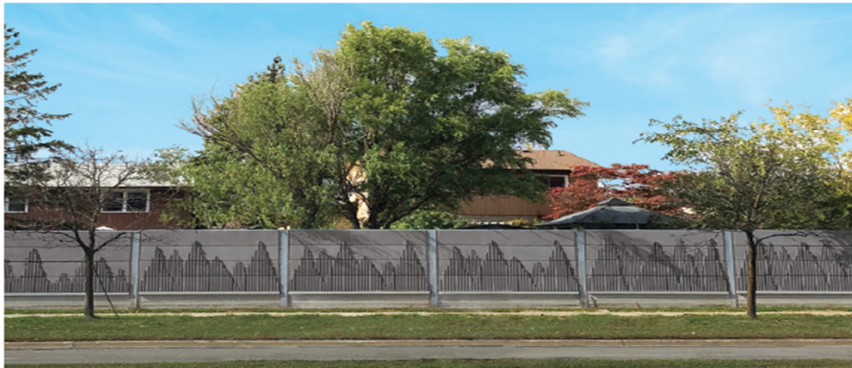
Option 2: medium-tone, neutral grey background and darker-tone, neutral grey trees