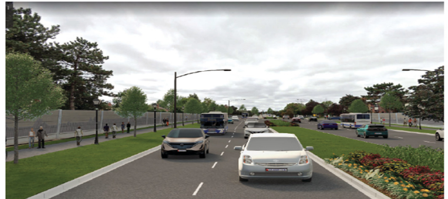
Option 3: medium-tone, warm grey background and darker-tone, neutral grey trees