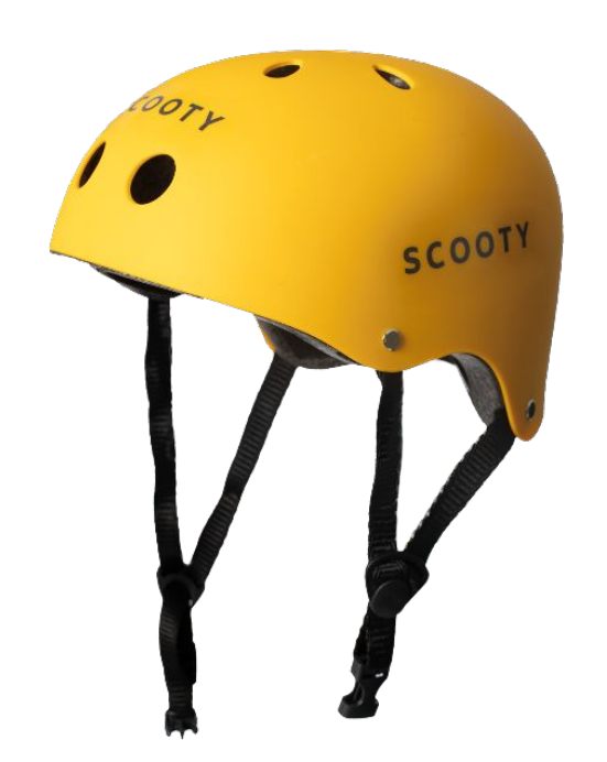
Micromobility and e-Scooters can transform urban transport