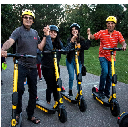
We hosted many riders of many diverse ages and abilities