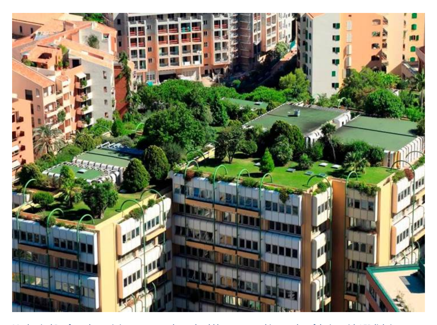
Mechanical Roof penthouse is just a concrete box, should be a more architectural roof design with LED lighting fixture: