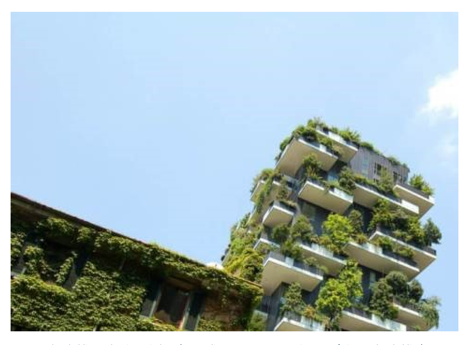
MITREX Solar Cladding ,Balconies, Windows (A Canadian Company : www.mitrex.com/mitrex-solar-cladding)