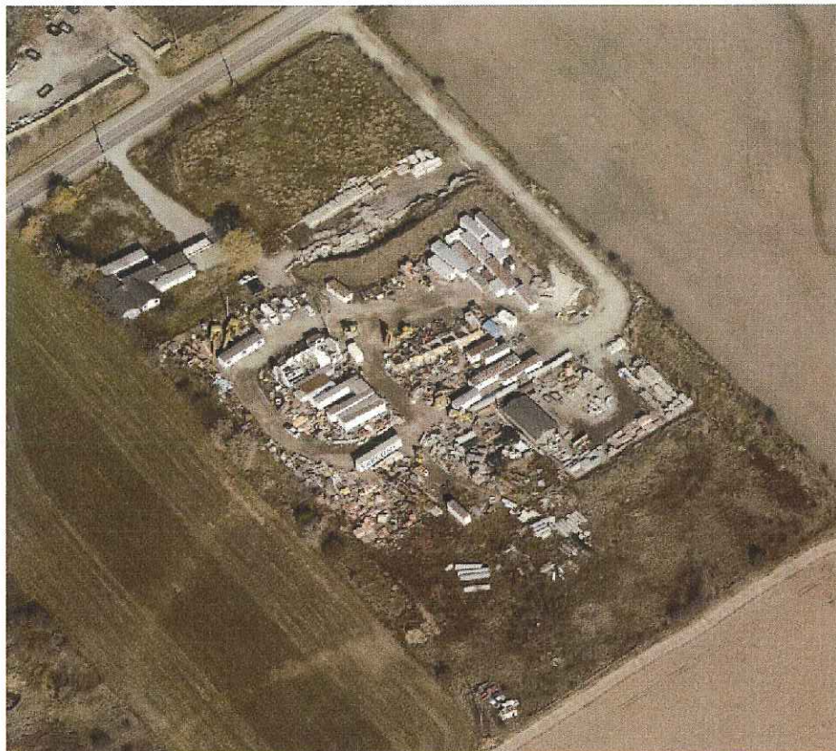
Internal GIS Imagery - November 2020