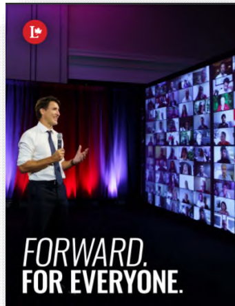
The Platform Highlights