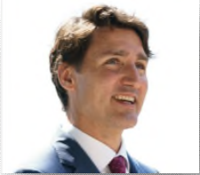
Justin Trudeau Prime Minister