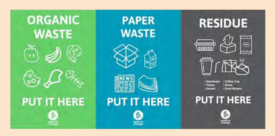
Effective waste sorting bins