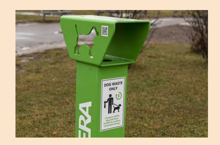
Implement dog waste bins in Parks