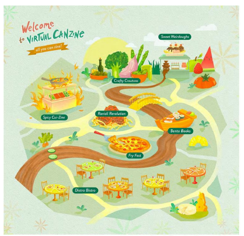
Food Map, by Meegan Lim