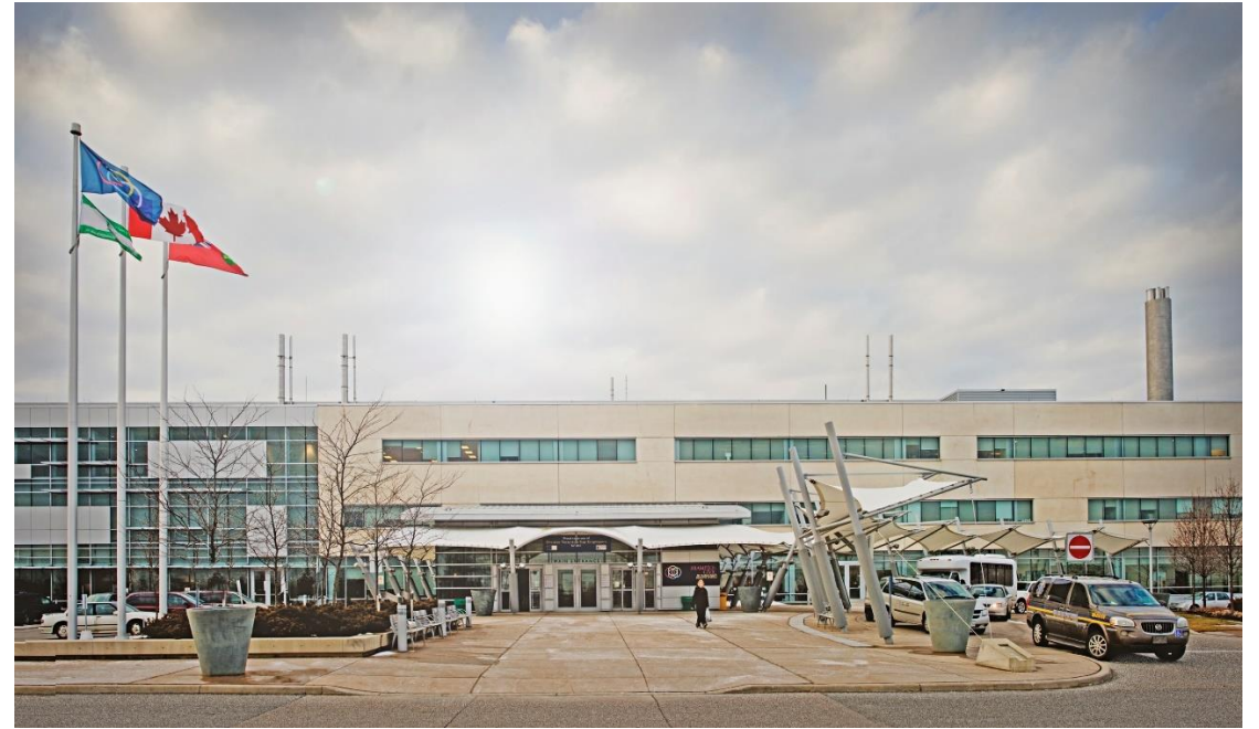
Brampton Civic Hospital