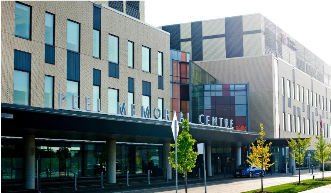
Peel Memorial Centre for Integrated Health and Wellness