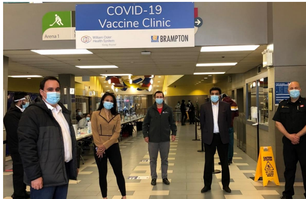
Century Gardens Vaccine Clinic