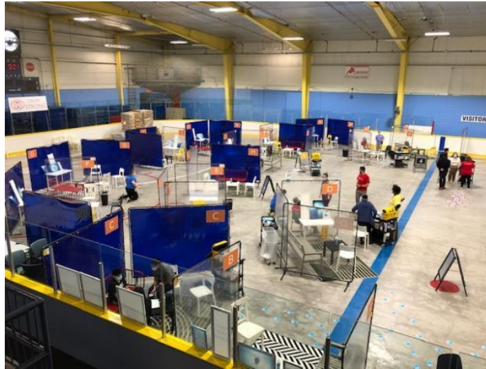
Youth Pad at Century Gardens Vaccine Clinic