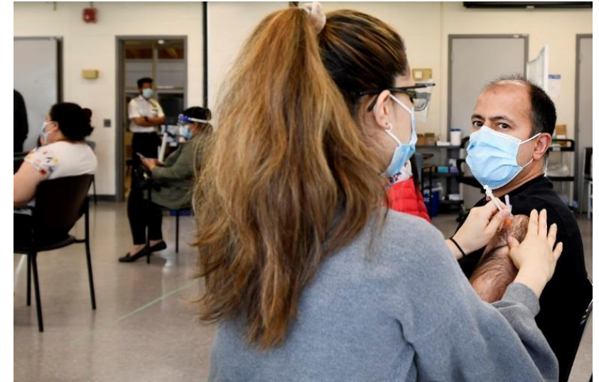
Chinguacousy Wellness Centre Vaccine Clinic