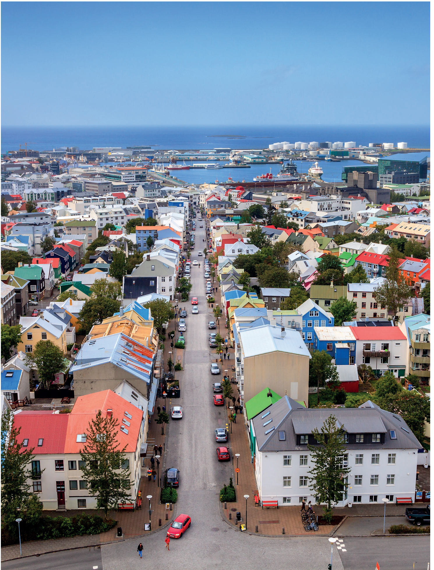
Aerial view of Skolavordustigur street and Midborg district of Reykjavik city, Iceland