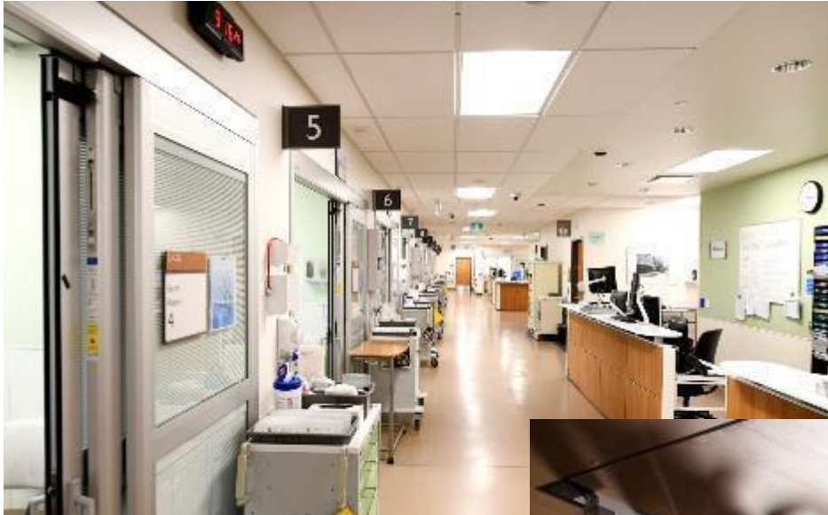
Urgent Care Centre Peel Memorial