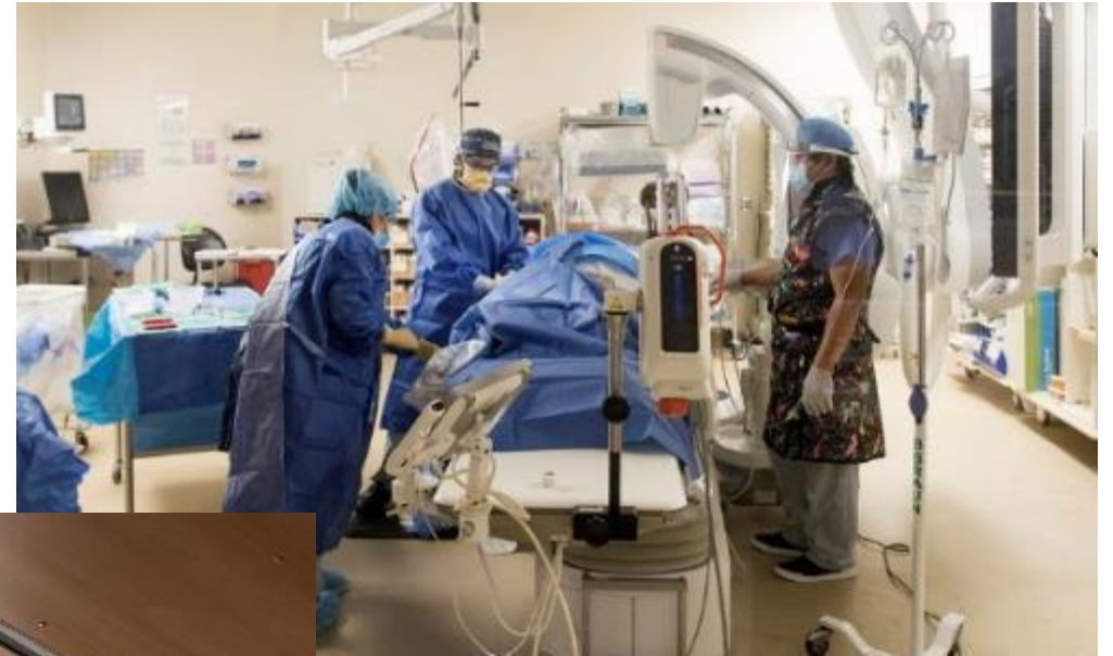
Interventional Angiography Brampton Civic Hospital