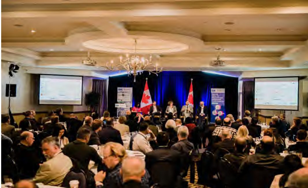
Make iT Secure: Cybersecurity in Manufacturing April 25, 2019