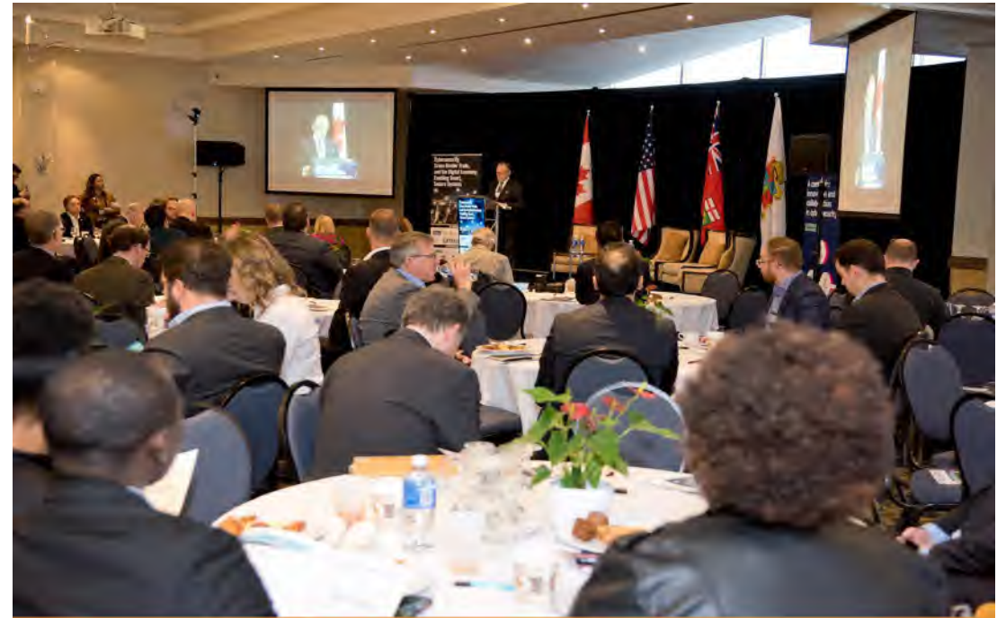
Cybersecurity, Cross-Border Trade, and the Digital Economy: Enabling Smart, Secure Systems November 19, 2019