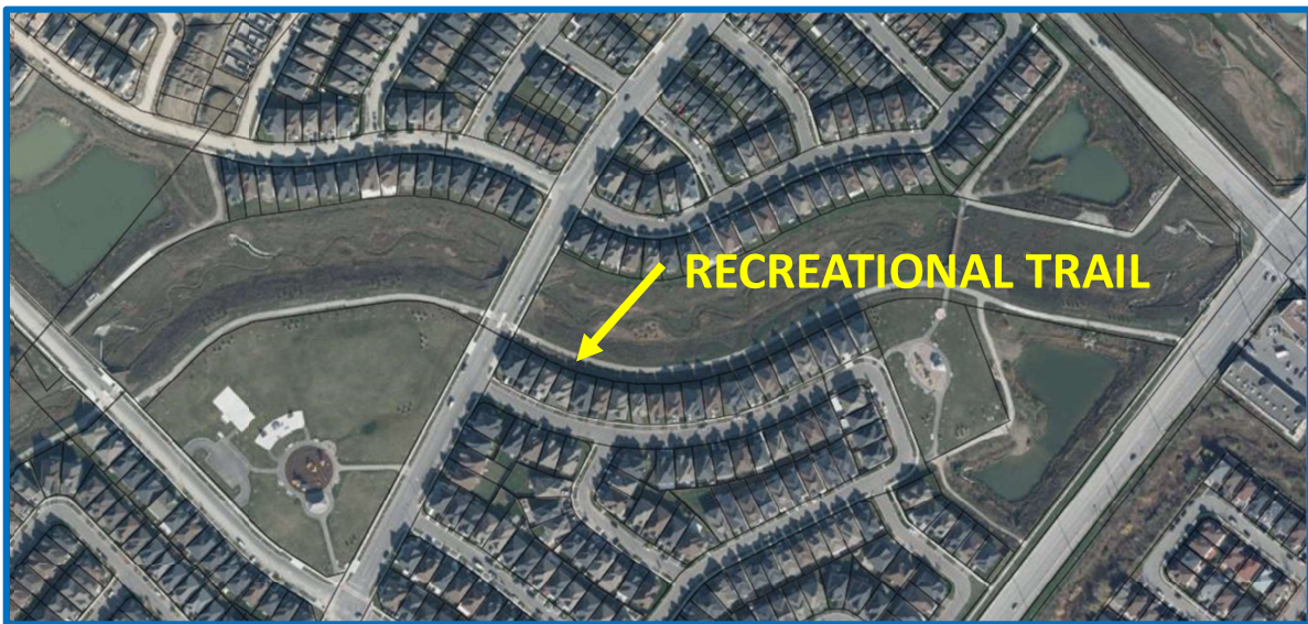
AERIAL PHOTO OF NHS BLOCKS AND RECREATIONAL TRAIL