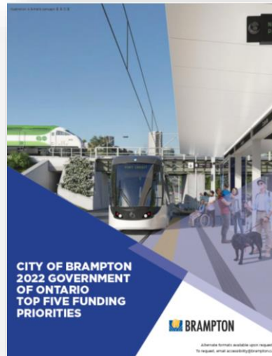
City of Brampton Provincial Priorities Booklet