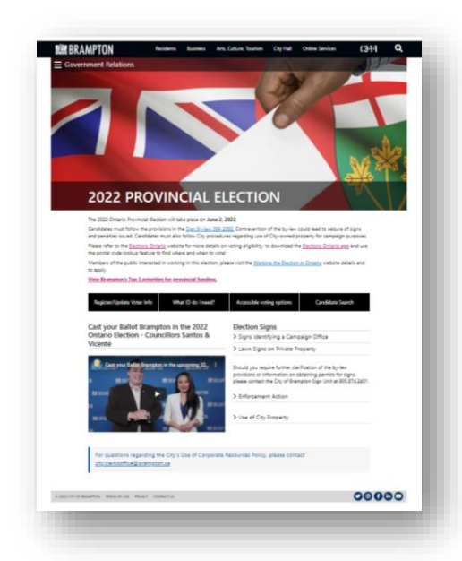
Election Information Web Site